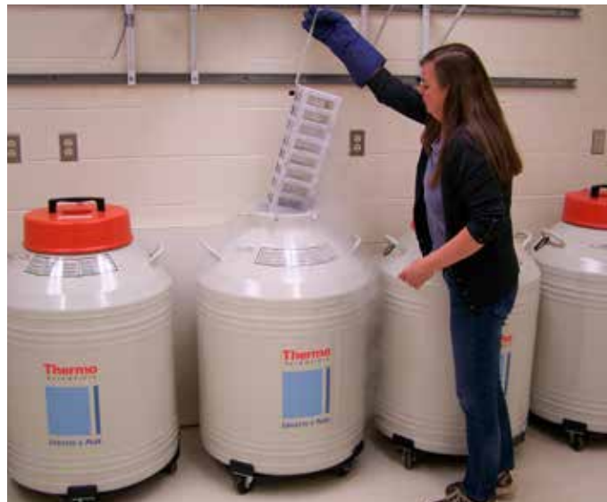
Liquid nitrogen tank used to store genetic material