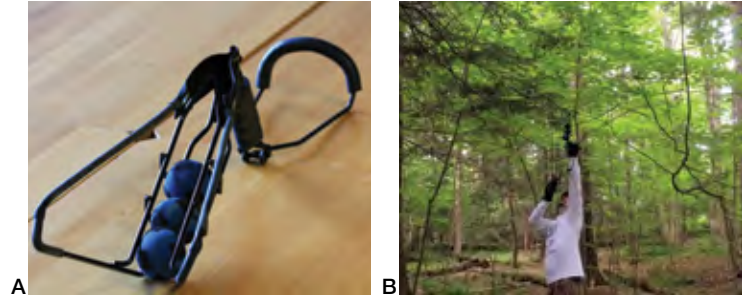
Figure 3. A) The Hyperdog™ ball launcher used in ball sampling with three Velcro®-covered racquet balls. B) Launching balls into the crown of hemlock.

This method consists of launching Velcro®-covered racquetballs with a sling shot (Hyperdog™ ball launcher) (Fig. 3) into tree crowns to snag HWA wool. Narrow strips of a fixed length of Velcro® (hook-side out) are glued onto each ball. Strips are spaced uniformly around each ball to ensure consistent flight. With this method it is possible to launch balls higher than 40 m and reach the tops of tall hemlocks.