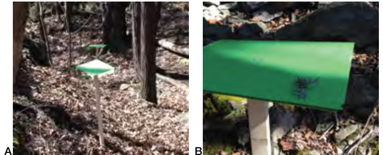
Figure 5. A) Pair of 25 x 25 cm sticky traps attached to stakes, set up under a group of hemlock trees at the 2014 detection of A. tsugae in the Niagara Gorge, with close up (B) of nearest trap showing nail in centre (right).

Traps should be installed just prior to the hatch of progreddens crawlers in mid-April and taken down just after sistens crawlers have settled in mid-July. Traps (25 × 25 cm or smaller) can be cut from brightly coloured, corrugated plastic sheets of 4-mm thickness or more. We prefer to use the commercially available green prism traps that are used for trapping the emerald ash borer ( Agrilus planipennis Fairmaire) in Canada because they already contain the sticky coating needed to trap crawlers and crawlers are easily seen against the green colour of the trap (Fig. 5). Approximately six sticky traps can be cut from each prism trap. Any trap design that meets these criteria could be used to trap crawlers.