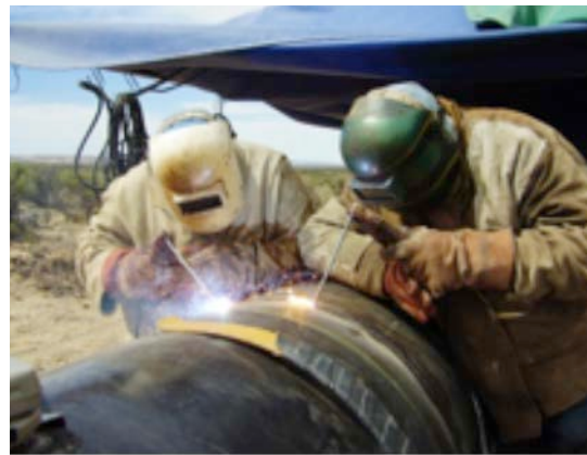
Lincoln Electric’s welders can survive the harshest environments from the desert to cold temperatures. Pictured here are pipeline welders joining a pipe. This picture hangs on the wall of the factory to remind the employees where our products are used.

Although Lincoln Electric senior executives understand the value of energy conservation, funds to invest in energy efficiency projects are limited. Energy projects must compete against other business priorities for funding. Management support is a key driver in the success of ISO 50001, and the belief in the value of energy management needs to come from the top. Company managers and executives played an active role in supporting energy conservation, including participating in energy management events such as employee meetings and NRCan’s Dollars to $ense Energy Management workshops.