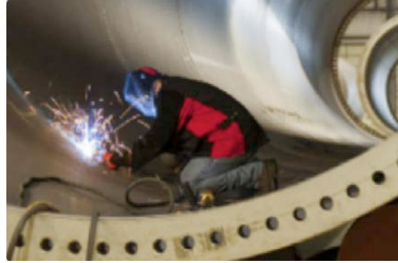
A welder works on a wind turbine. Lincoln Electric is one of the world's largest suppliers of welding and cutting equipment to the wind tower industry.