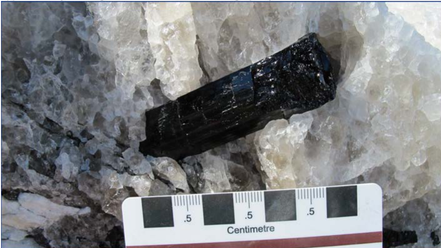
Figure 8. Prismatic schorl tourmaline in a quartz- and feldspar-dominated pegmatite dyke that cuts through metasedimentary rocks (unit PLHs) on central Hall Peninsula, Baffin Island, Nunavut. 2015-065