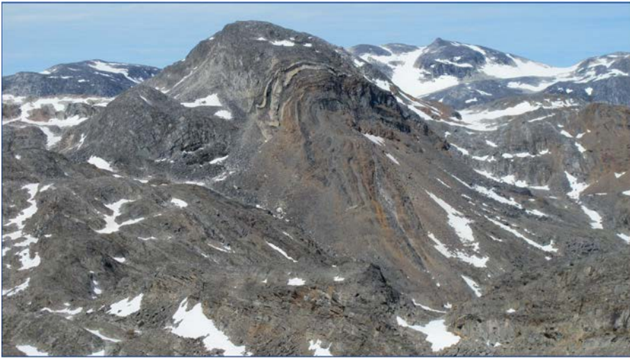
Figure 5. Overturned, recumbent fold of Archean biotite tonalite orthogneiss (top of prominent hill and left; unit At), and Paleoproterozoic metasedimentary rocks (core of fold and right; unit PLHs) in the Finger Land area of northern Hall Peninsula, Baffin Island, Nunavut. View looking west, prominent hill is approximately 250 m tall. 2015-062