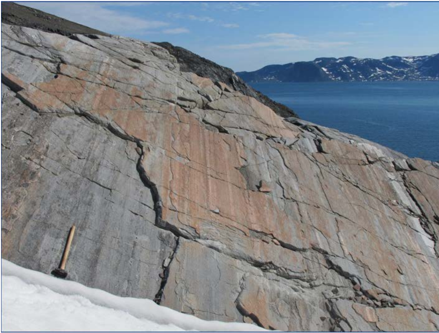
Figure 7. A foliation surface in biotite-hornblende tonalite orthogneiss (unit \bar{A}t ) with a well-developed L_2 lineation defined by rodded quartz and oriented hornblende. This surface is a few metres above the east-verging T_2 thrust contact between Archean orthogneiss in the hanging wall and Paleoproterozoic metasedimentary rocks (unit PLHs) in the foot wall. Hammer for scale is approximately 1 m long, view to the northeast. 2015-064