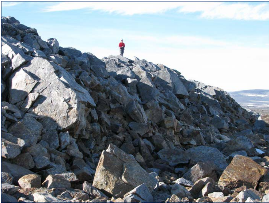
Figure 4. A ridge of blue-grey quartzite (unit PLHq) marks the disconformity between the base of the metasedimentary sequence and underlying Archean tonalite orthogneiss (not seen in this photograph) on Hall Peninsula, Baffin Island, Nunavut. Geologist for scale is approximately 1.75 m tall. 2015-061