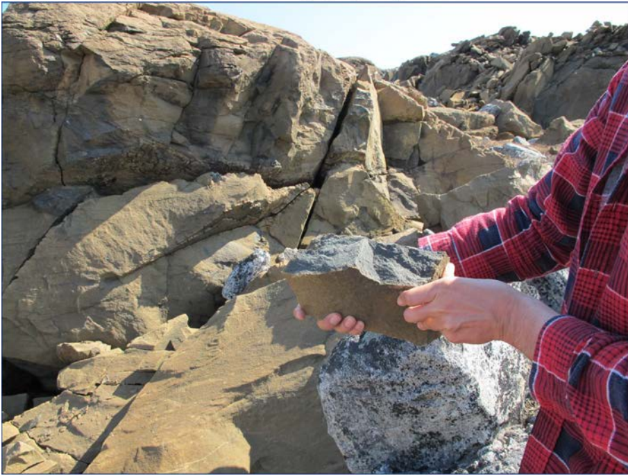
Figure 6. An altered ultramafic body (unit Pu) on Leybourne Island, Hall Peninsula, Baffin Island, Nunavut, has been tested for its suitability as a carving stone and found to be medium-hard, with a very reflective, black polished surface. Based on the location of the deposit (proximity to tide-water), and abundance and quality of the stone, this deposit is documented as a new carving stone reserve for local artists. 2015-063