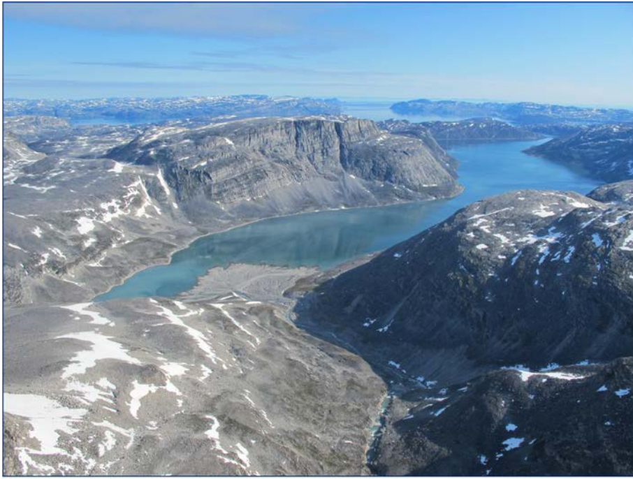
Figure 3. Shallowly west-dipping, biotite tonalite orthogneiss (unit At) comprises most of the glacially carved fiords on eastern Hall Peninsula, Baffin Island, Nunavut. Vertical cliff in mid-ground is approximately 640 m tall from sea level. 2015-060