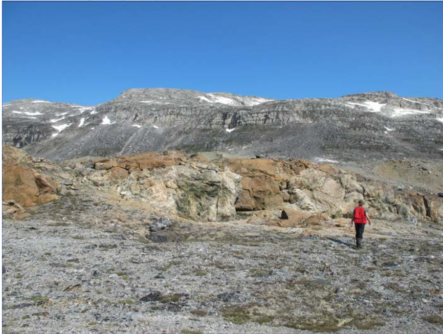
Figure 8. A pervasively and heterogeneously altered ultramafic sill (unit Pu) that marks a thrust contact between sheets of Archean tonalite orthogneiss (unit At) on Moodie Island, Hall Peninsula, Baffin Island, Nunavut. The alteration zone at the outer edges of the ultramafic body is dominated by tremolite, actinolite, diopside, phlogopite, and serpentine, while the internal part of the body contains olivine, orthopyroxene, and clinopyroxene, presumably the original mineralogy of the intrusion. Geologist for scale is approximately 2 m tall. Photograph by Z.M. Braden. 2015-058