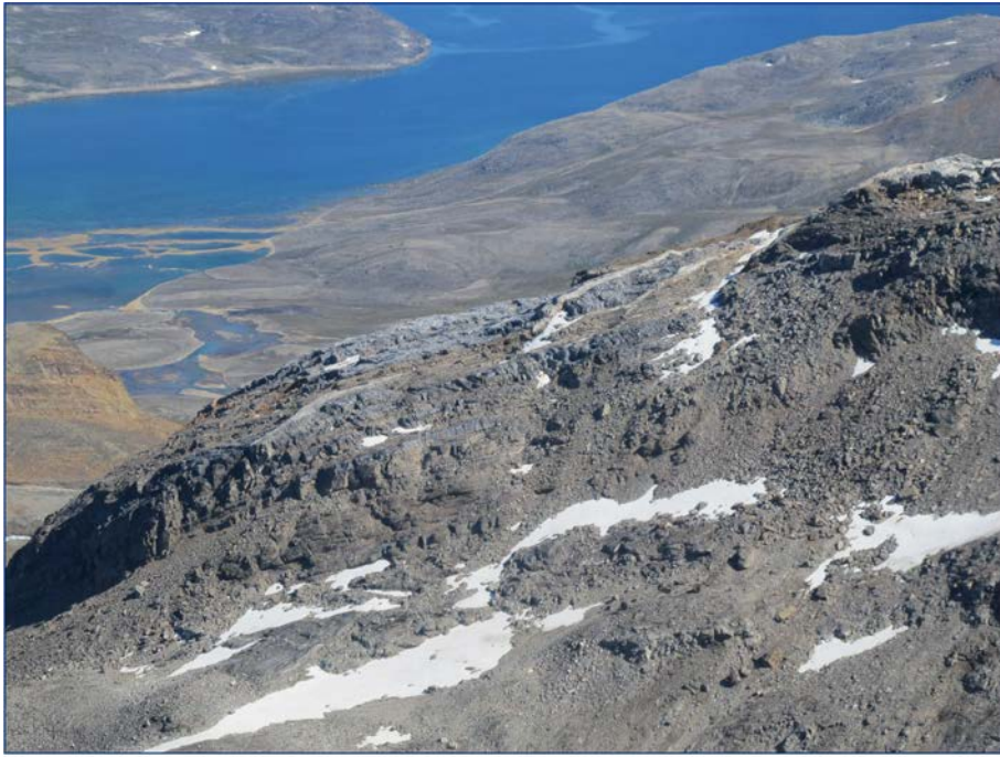
Figure 5. Grey-blue quartzite (unit PLHq) and interlayered brown semipelite at the base of the metasedimentary sequence on northern Hall Peninsula, Baffin Island, Nunavut, is intersected by white granitic pegmatite dykes. View looking east, outcrop is approximately 600 m long. 2015-055