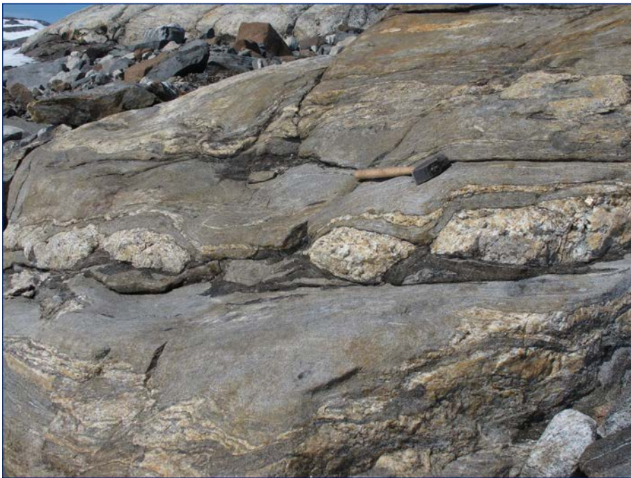
Figure 6. Semipelitic metasedimentary rocks (unit PLHs) contain layer-parallel leucocratic lenses and layers that have been folded and boudinaged likely due to D_2 deformational events of the Trans-Hudson orogen on Hall Peninsula, Baffin Island, Nunavut. Hammer for scale is approximately 30 cm long. 2015-056