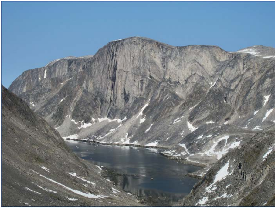
Figure 3. Glacially carved fiord walls composed of vertically-dipping biotite tonalite orthogneiss (unit At) on Moodie Island, northern Hall Peninsula, Baffin Island, Nunavut. 2015-054