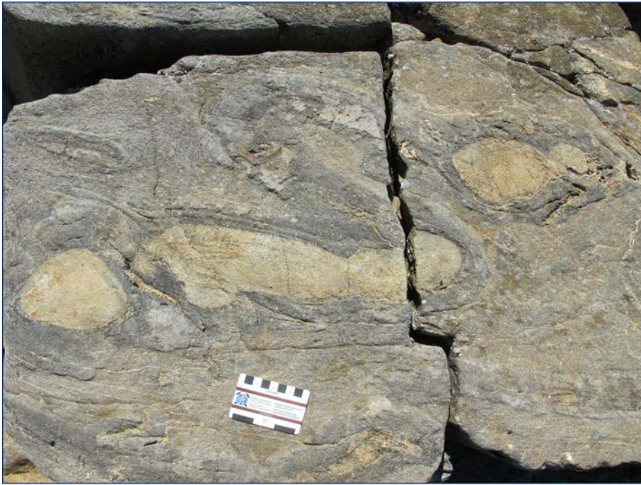
Figure 7. Greenish-grey pods with clearly defined boundaries found within amphibolite metasedimentary rocks (unit PLHa) on northern Hall Peninsula, Baffin Island, Nunavut. The pods contain an amphibolite-facies mineral assemblage including grossular garnet, fine-grained diopside, and carbonate minerals, suggesting that they may have originally been carbonate concretions. 2015-057