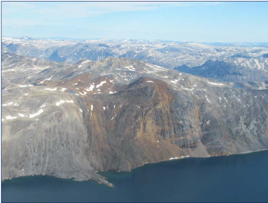
Figure 4. Paleoproterozoic metasedimentary rocks (unit PLHs) disconformably overlying Archean biotite tonalite orthogneiss (unit At) exposed along Littlecote Channel have been tightly folded into a large, east-west trending, synform on northern Hall Peninsula, Baffin Island, Nunavut. The shoreline is approximately 2.2 km long. 2015-081