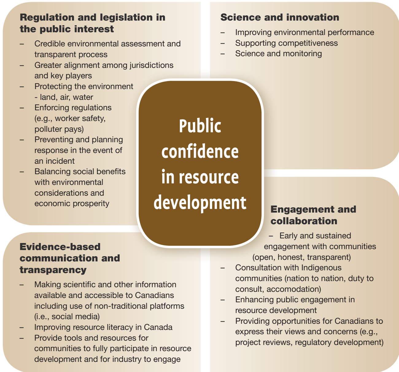
Figure 1: Scoping the role of federal, provincial and territorial governments