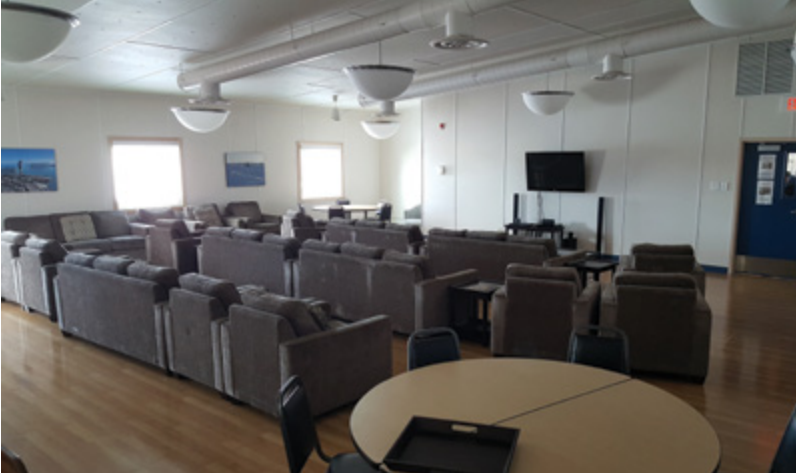
A lounge in the Martin Bergmann Complex

The Martin Bergmann Complex has lounges with satellite television, a library, a fully equipped fitness room, offices and meeting rooms, and a boardroom that may be reserved by contacting a PCSP Logistics Operations Officer on site.