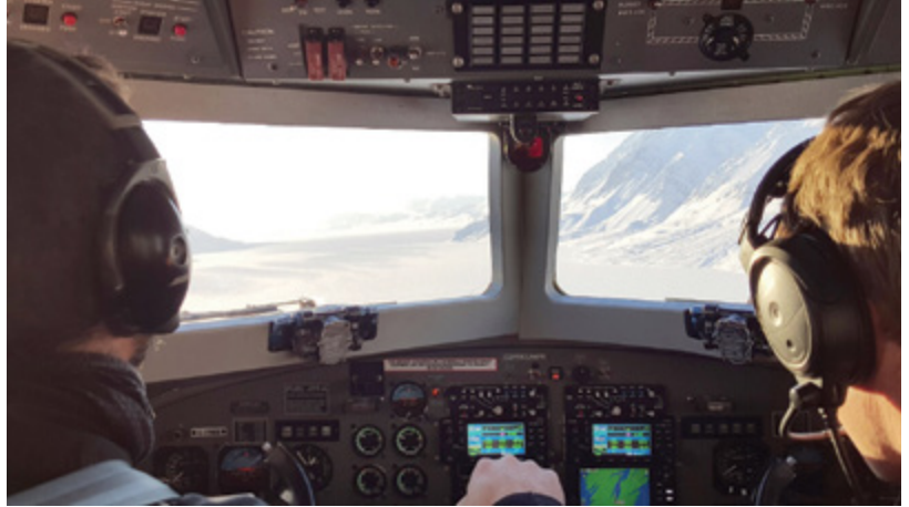
Pilots prepare to land an aircraft on Ellesmere Island, Nunavut.

If you need an unplanned fuel cache to be established in the field, fuel call out charges will apply (i.e. you will be charged for the aircraft hours required to move the fuel).