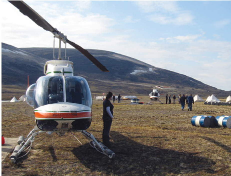
A field camp on the Cumberland Peninsula of Baffin Island, Nunavut

Note that most employers will require that documentation of any incidents be provided immediately for occupational health and safety reporting and compensation claim process requirements. You should have a list of field participants and their emergency contact information with you and with your employer. You will also be required to provide a copy of this list to the PCSP Logistics Operations Officers.