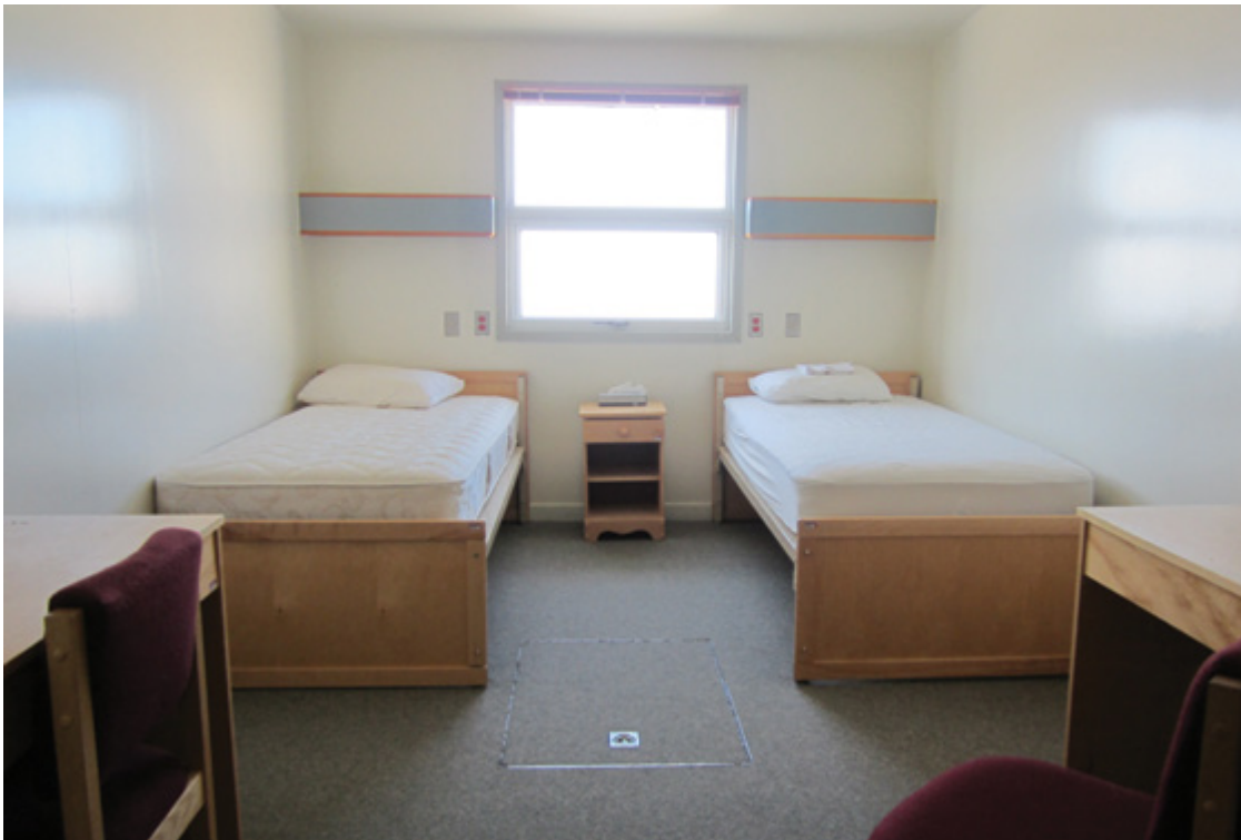
A shared bedroom at the facility

your own sleeping bag; sheets and blankets are not provided. You will also need to bring a towel, washcloth and personal toiletries. Washers, dryers and laundry soap are available at the facility.