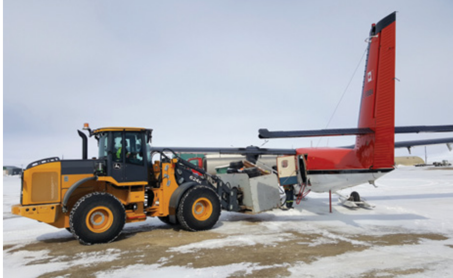
A Twin Otter aircraft is loaded in Resolute, Nunavut.

If you bring boxes of food for your field camp and plan to leave them at the PCSP facility in Resolute for future camp resupply, organize and number them so that you can call on the radio for specific boxes for each supply run.