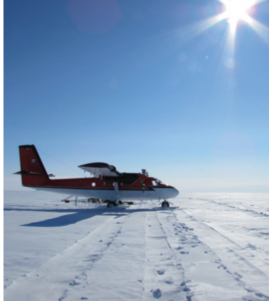
A Twin Otter aircraft on sea ice