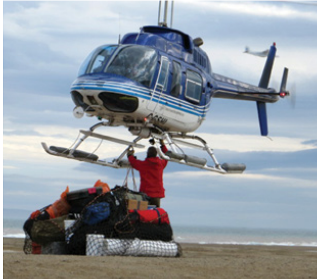
A sling load is attached to a helicopter on Banks Island, Northwest Territories.

PCSP planning and coordination is intended to reduce costs for projects while maintaining a focus on field safety. The PCSP provides advice, coordination and planning free of