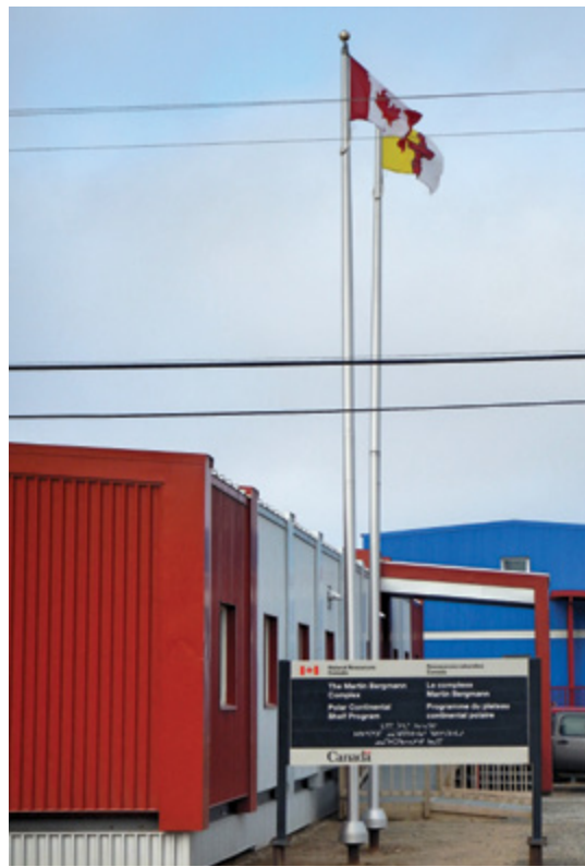
The main entrance to the Martin Bergmann Complex

PCSP staff will assign a room to you upon arrival, according to operational and accessibility requirements. Every bed has a mattress with a cover and a pillow with a cover. You must bring