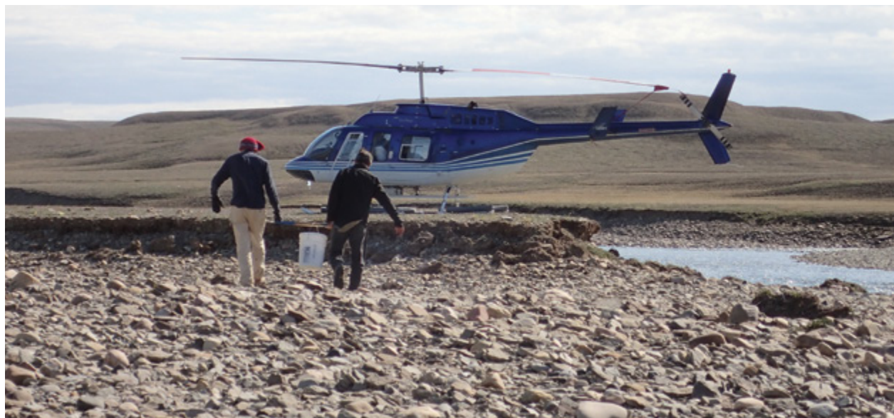
Researchers carry a sample pail to a helicopter at Parker River, Banks Island.

*Note: All loads listed in the table include passengers whose average weight is assumed to be 82 kilograms (kg). The data reflect the performance of aircraft under ideal conditions.