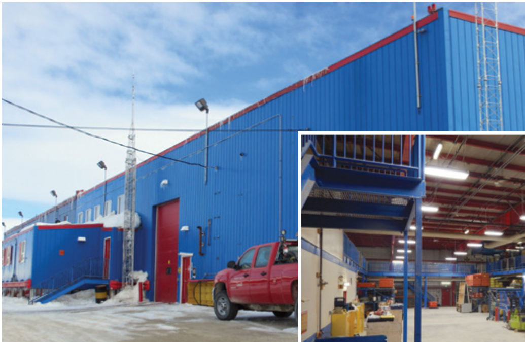
PCSP Operations Centre

The ATC Operations Centre was added in 2013, effectively doubling the size of the PCSP Operations Centre; however, the ATC Operations Centre is uniquely designed to meet DND needs and is not generally available for use by PCSP clients from other organizations.