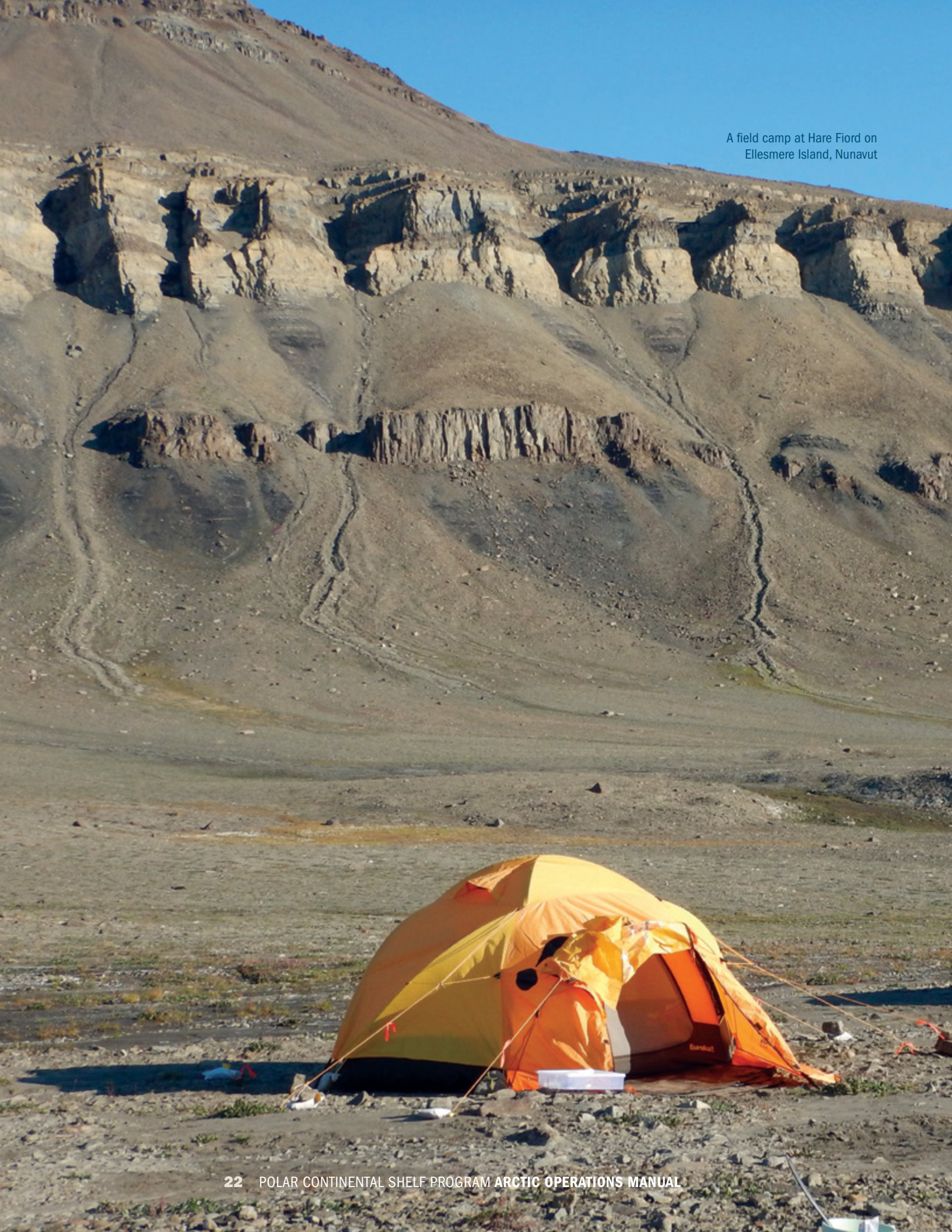
A field camp at Hare Fiord on Ellesmere Island, Nunavut