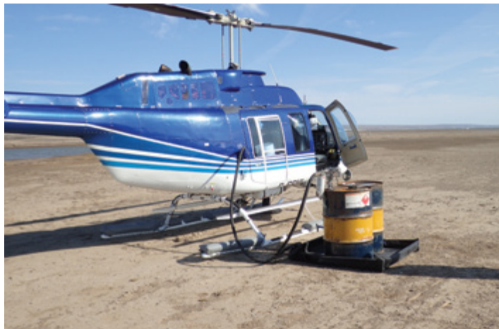
Refueling a helicopter at Johnson Point on Banks Island, Northwest Territories

All spills of petroleum products or other hazardous materials over a certain quantity must be reported immediately to a PCSP Logistics Operations Officer and to the 24-hour spill report line for the territory in which you are working. See Section 2.5.1 Reporting fuel or hazardous materials spills for further details about reporting spills.