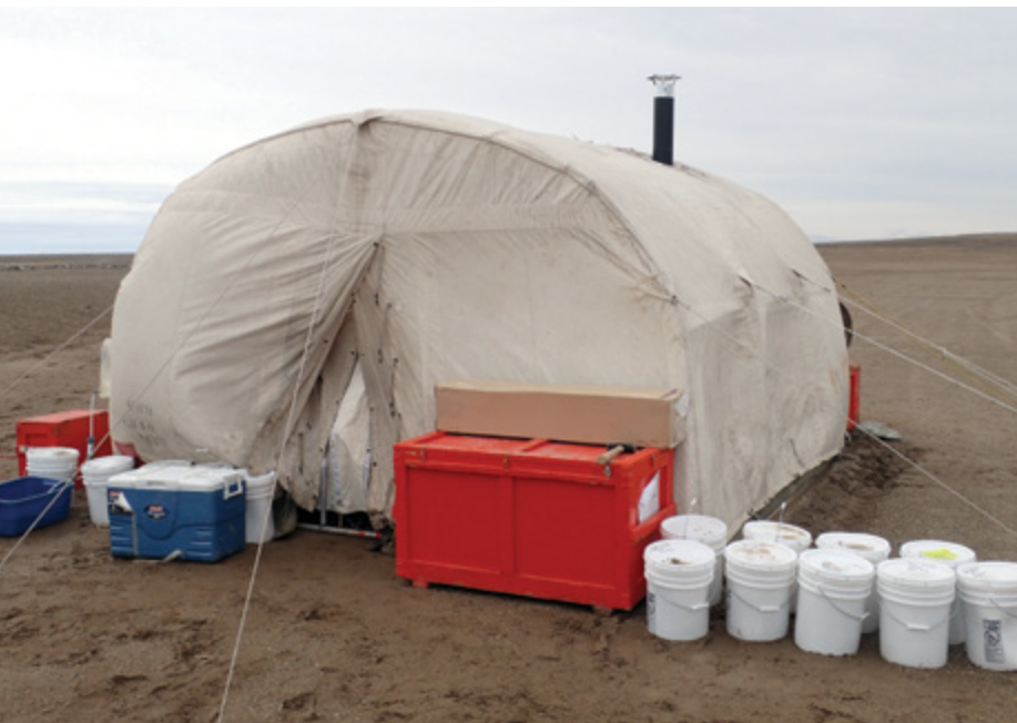
A longhouse tent at a field camp at Johnson Point on Banks Island, Northwest Territories