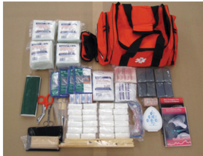
Standard (above) and portable (below) first aid kits are available through the PCSP.

Field party members should bring an adequate supply of any required medication for the duration of field work, including enough to cover any unexpected travel delays. If you are allergic to bee stings, carry appropriate allergy medication because bees live as far north as Alert, Nunavut.