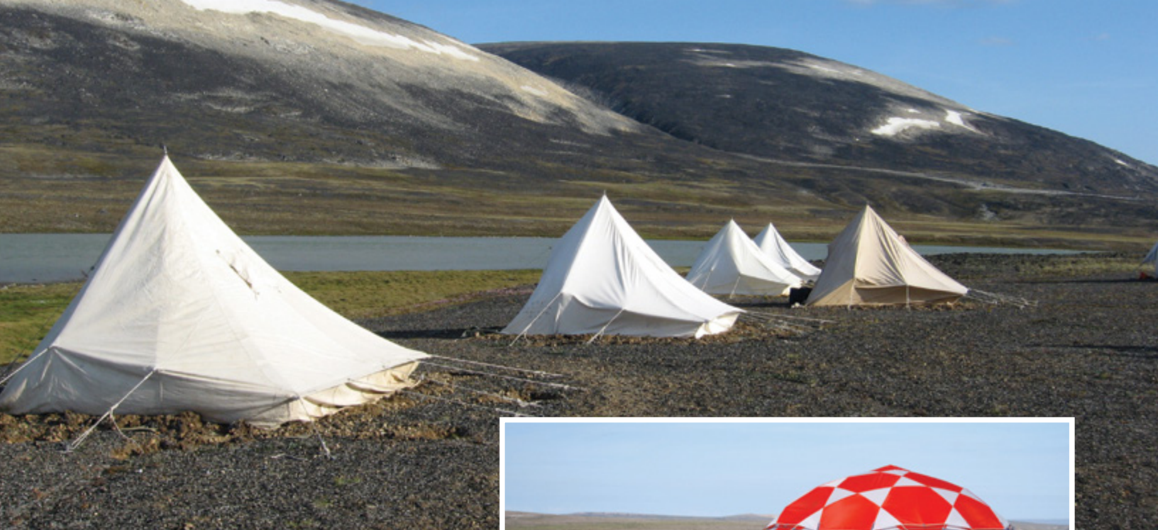
Logan tents at a field camp on Baffin Island, Nunavut