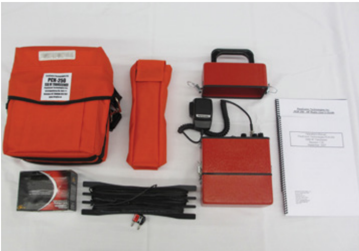
An HF radio kit available from the PCSP

If your project is supported by the PCSP and a PCSP radio has been issued to you, a separate licence is not required. The PCSP holds the licence, and you will be covered by it.