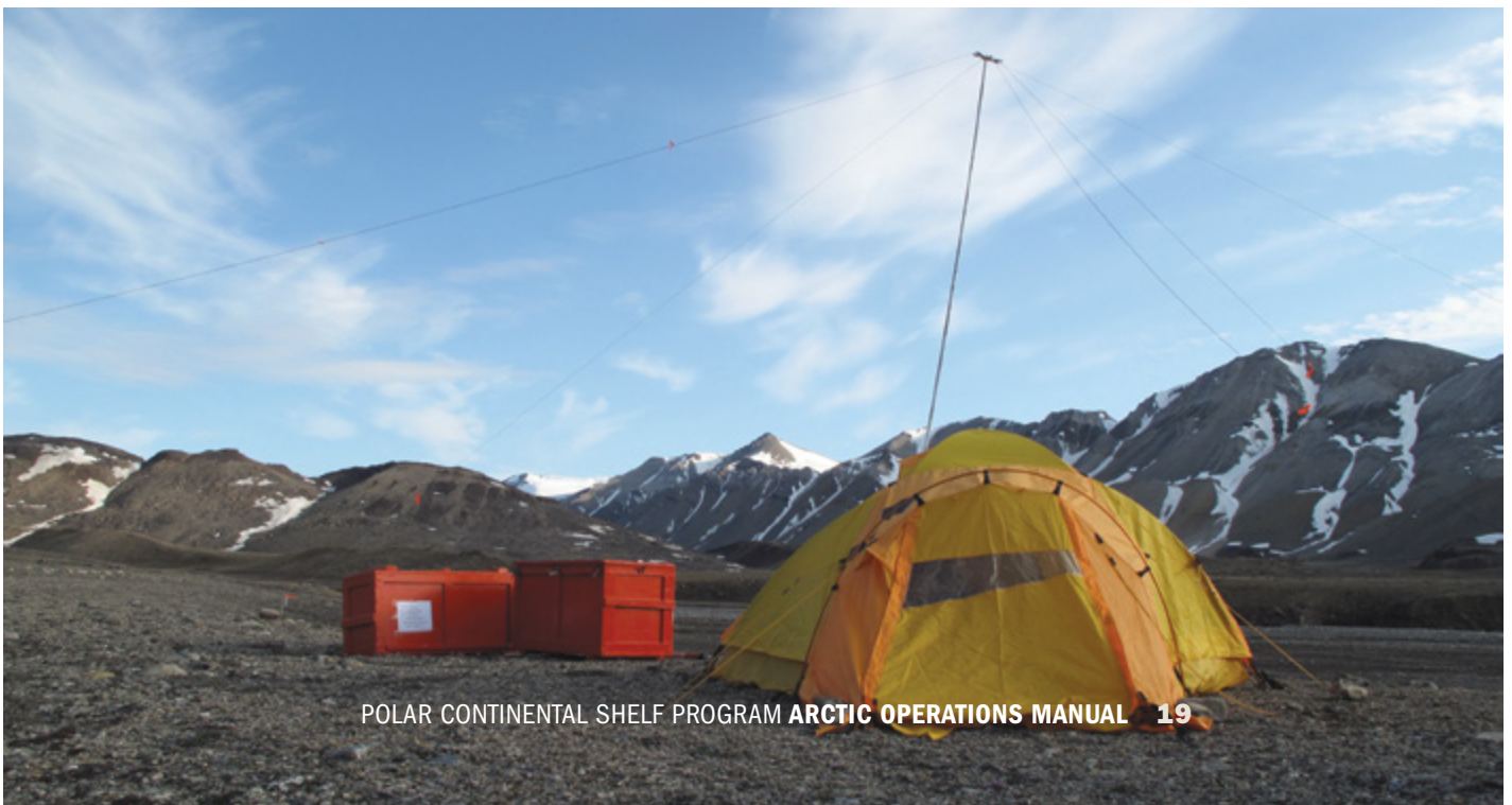
An HF radio antenna at a field camp on Axel Heiberg Island, Nunavut

Ensure that your field party has a plan in place for communicating with any groups who are separated from the main camp on day trips. Whether using satellite telephones, high-frequency radios or other communications equipment, your field party must ensure that enough devices are available for the main camp and each group of researchers that is working away from camp on day trips. Have a means of communication other than radio, in case issues arise with using the radio system. Field team members must be familiar with the daily communications routine with the main camp and with the PCSP.