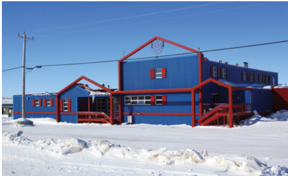
An accommodations building at the PCSP Arctic logistics hub