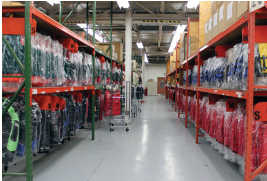
Field clothing is part of the PCSP's field equipment inventory.