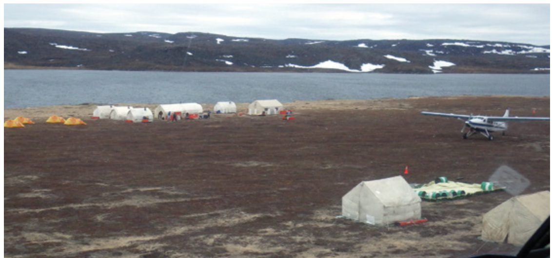
A field camp at Lorillard River, Nunavut