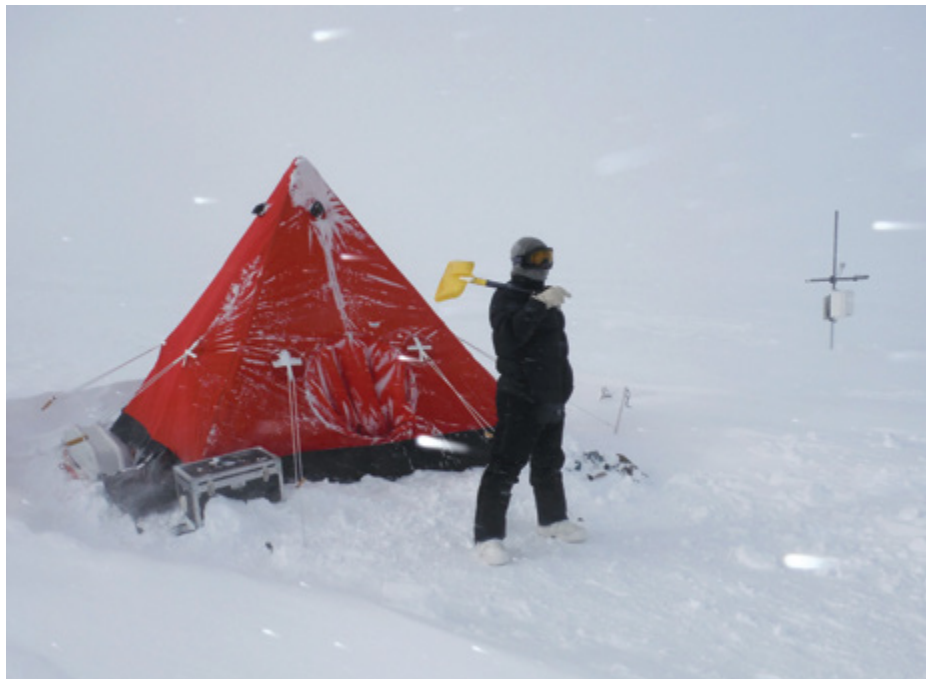
Researchers wait out a storm at a field camp on Devon Ice Cap, Nunavut.

type of precipitation falling (if applicable), and wind speed and direction. It is important that you be as accurate and knowledgeable as possible when providing weather information. During the radio call, PCSP Logistics Operations Officers can provide a general overview for your area to help you with planning your daily activities, if requested.