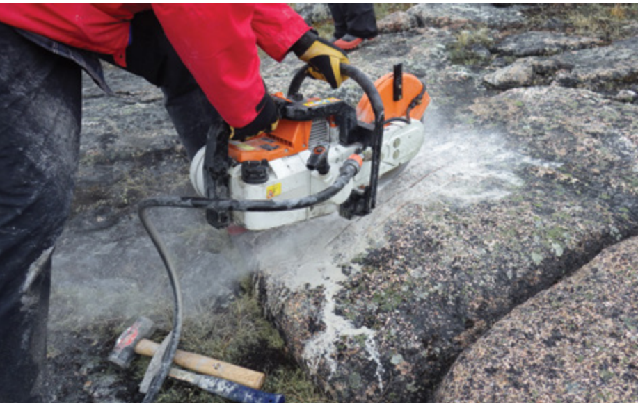
A rock saw is used to sample bedrock west of Wager Bay, Nunavut.