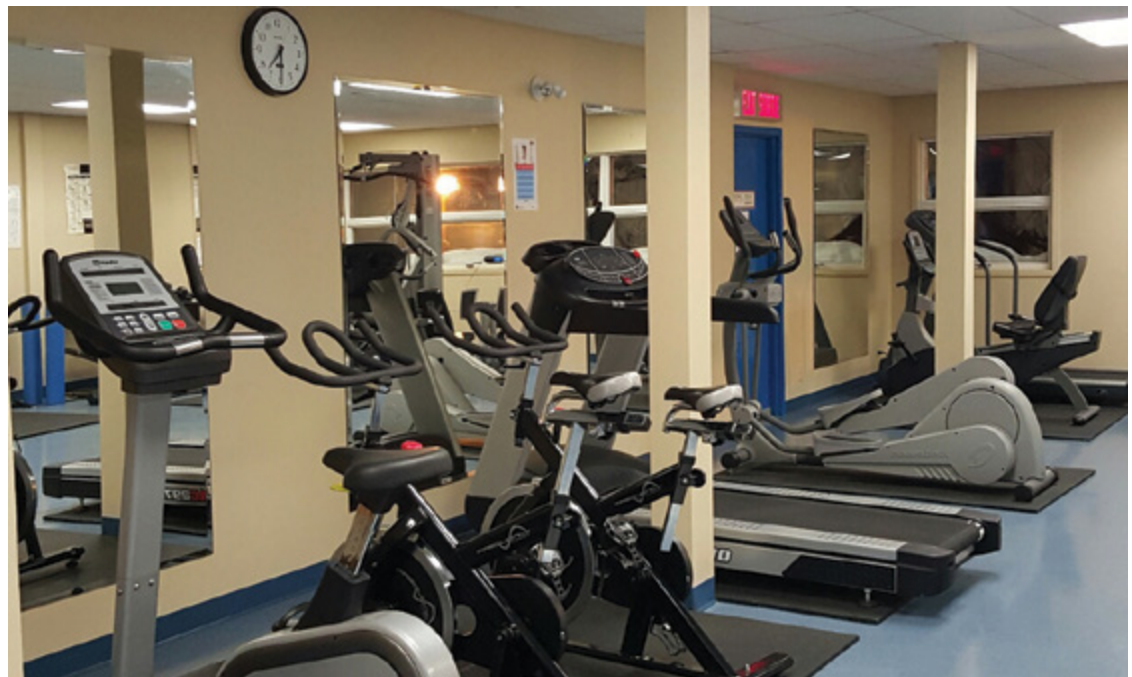
The fitness centre at the facility

Two telephones in privacy booths are available for visitors to make personal calls, either by calling collect or using a calling card that you bring with you. The Co-op store in Resolute sometimes has calling cards for purchase.