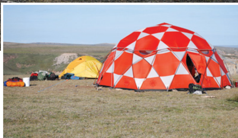
A field camp near the Hornaday River, Northwest Territories

The disposal of litter and garbage is a major challenge. Take all solid garbage out of the field with you for proper disposal. The increased sensitivity toward the problem of litter is backed by laws and regulations that govern disposal and levy penalties. Litter around camp is more than an eyesore; it gets blown by the wind