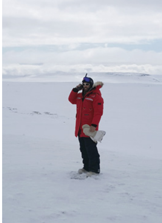
A satellite telephone is used in the field.

The call sign for Resolute is XMH-26. Field camps usually use call signs that indicate their geographic locations.