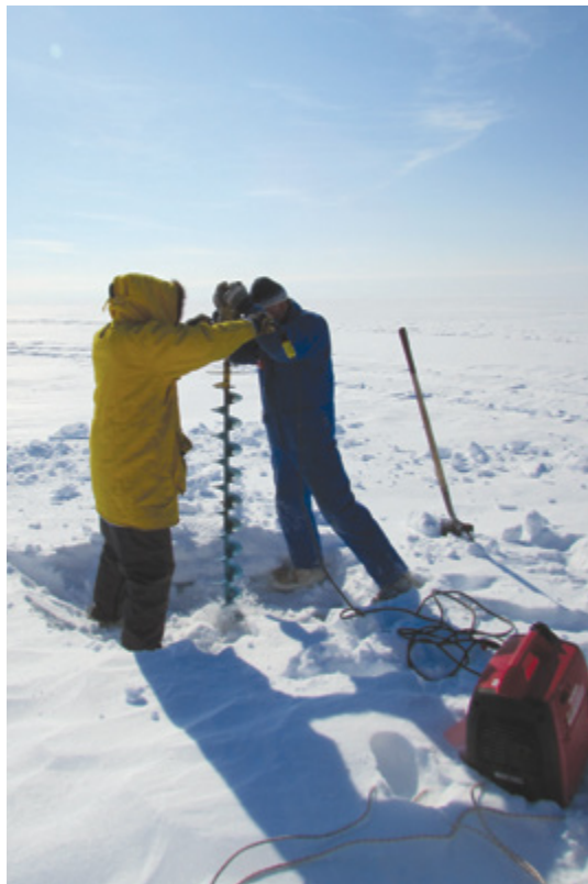
An auger is used to drill a hole through sea ice.

Note that PCSP will not put anyone alone into the field. Field work should be conducted in teams. Every field party must have at least one person in the field at all times who has significant experience working in the Arctic. Significant experience is defined as a depth and breadth of experience normally acquired by having performed a broad range of related activities in the field for a period of at least three years.