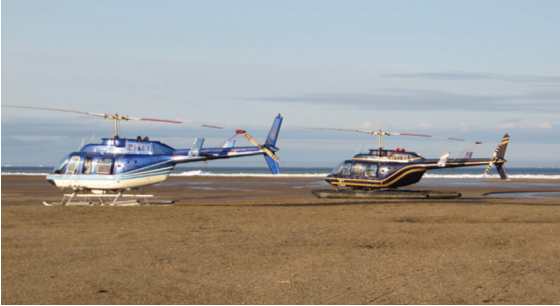
Helicopters are tethered at a field camp at Johnson Point on Banks Island, Northwest Territories.