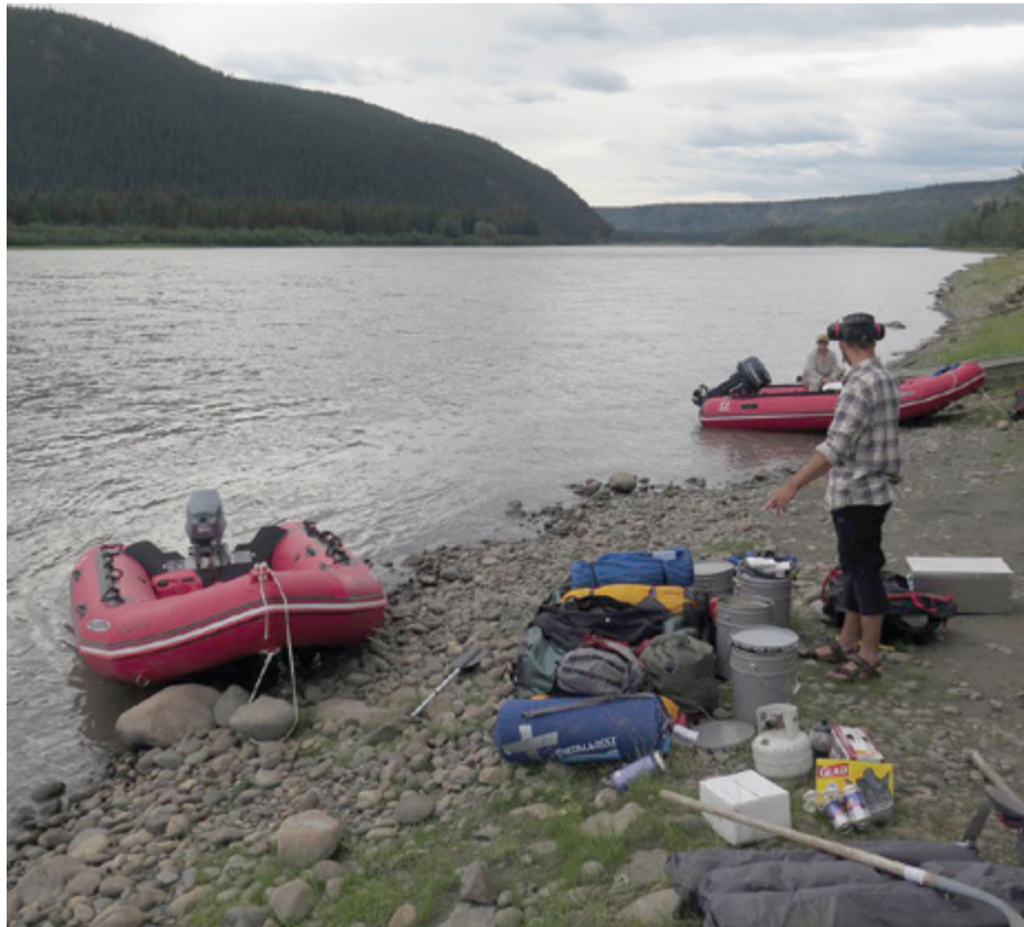
Researchers load field gear into inflatable boats on the Pelly River as part of geological studies in Yukon. Inflatable boats are part of PCSP's field equipment inventory.