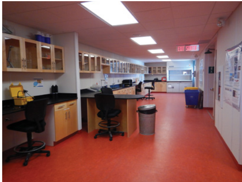
Dr. Roy M. "Fritz" Koerner Laboratory