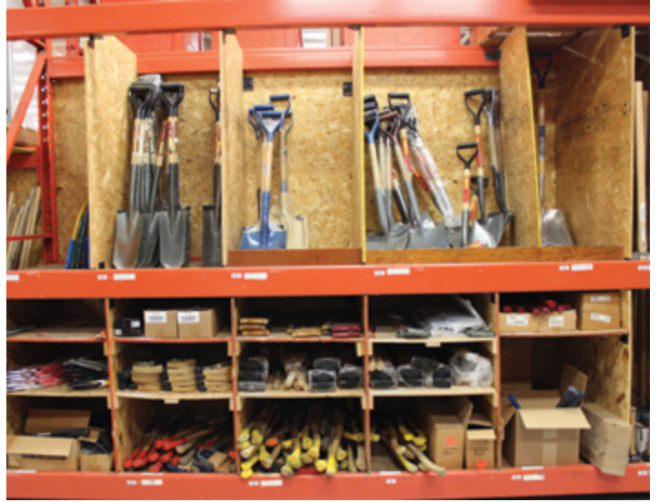
All-terrain vehicles (left) and field equipment (right) at the PCSP Ottawa logistics hub