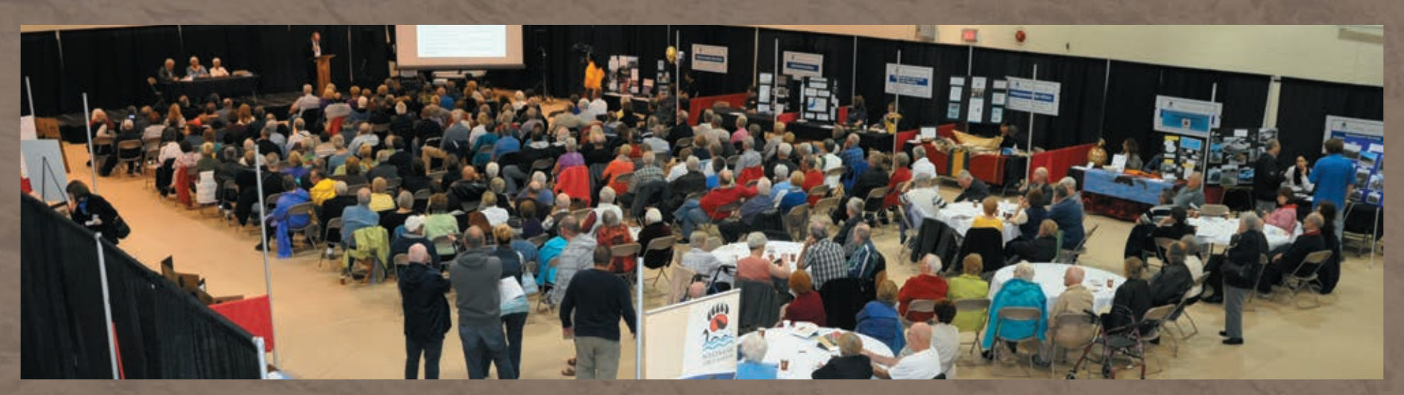
WFN residents attend the Open House and Annual General Meeting hosted by the Advisory Council

Priorities for the WFN government are set out in the strategic plan and budget for the year. Capital projects continue to be a priority of the WFN Government as they were in 2013-2014, including member housing, completing the new Youth Centre and a number of other infrastructure projects. In addition, WFN continues to make education, training, and capacity building for its Members a top priority. For its part, the WFN finance department continues to improve its standards and efficiency as it strives to set the standard in First Nation Financial Services for First Nation governments. Strong financial management is seen by WFN as one of the keys to the success of implementing self-government.