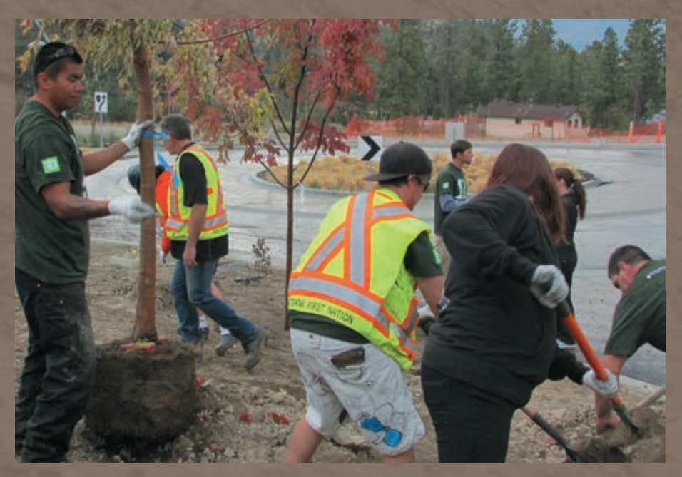
WFN Members volunteers help with landscaping projects