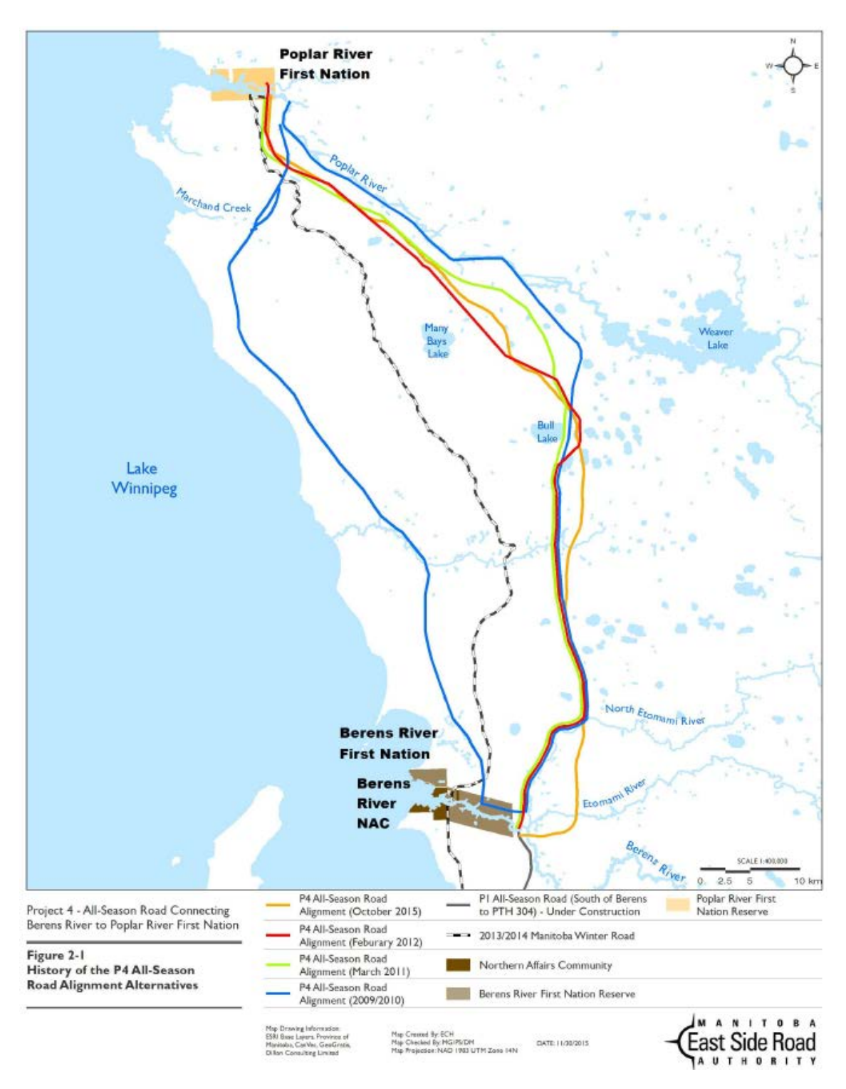
Figure 4 Route Alignment Alternatives