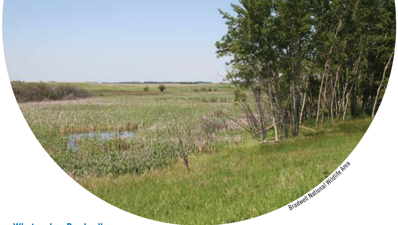
Bradwell National Wildlife Area