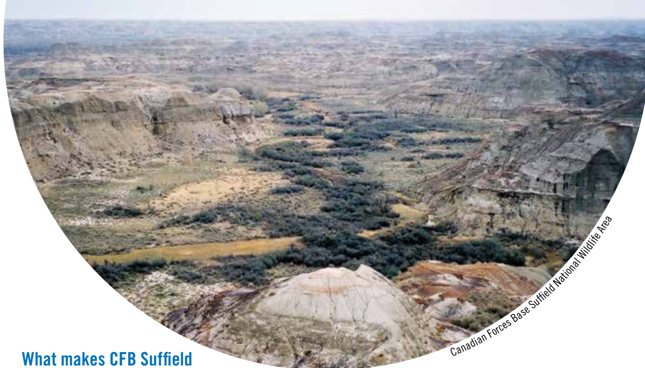
Canadian Forces Base Suffield National Wildlife Area