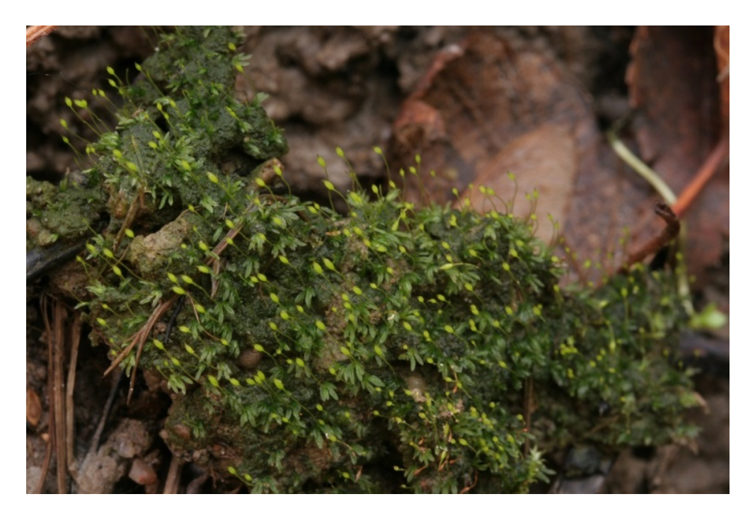
Figure 1. Photograph of Pygmy Pocket Moss on a clay bank in Franquelin, QC, by bryologist Stéphane Leclerc. Plants (leaves plus immature spore capsules) are less than 1 cm tall.