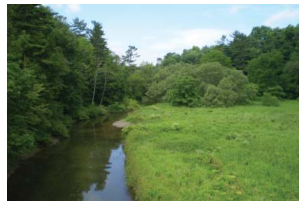
Pickering history traces the name “Petticoat” as a variation of “Petite Côte”, used by French settlers in the 1600s in reference to the creek mouth where one bank is quite high, and the other side low and flat.