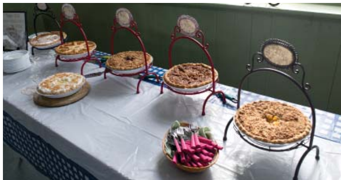
Myrna Burkholder graciously made six of her famous homemade pies for the park tour – these are even more delicious than they look!