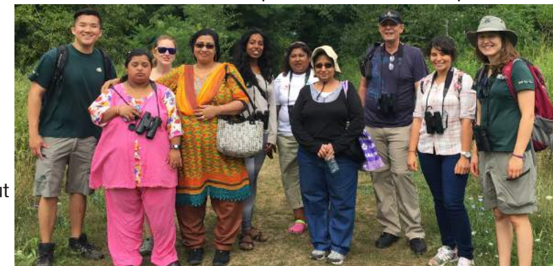
East Scarborough Storefront hike in the Rouge