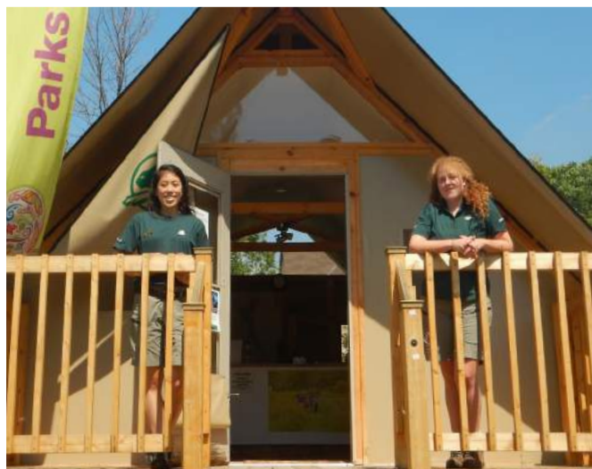
Welcome Area near the Toronto Zoo

After Labour Day weekend both welcome areas will switch from a seven-day to a five-day schedule and will be open from Wednesday to Sunday 9:30 a.m. to 4:30 p.m. until they close for the season after Thanksgiving.