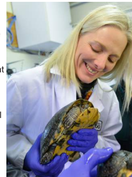
The Honourable Catherine McKenna