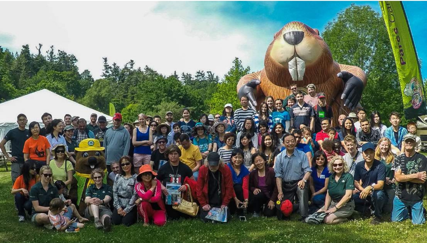
Parks Canada's June 2016 Learn to Camp at Glen Rouge Campground in Toronto