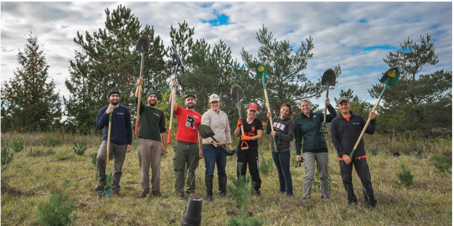
Indigenous partners from Six Nations of the Grand River, the Huron-Wendat, and Mississaugas of the New Credit First Nations, along with TRCA and Parks Canada staff

This brings the total number of restoration projects completed in the park to 31 in just two years. Working in collaboration with the TRCA, farmers, municipalities, Indigenous partners, schools and volunteers, we have already restored more than 32 hectares of wetland and riparian habitat, 20 hectares of forest, and have planted more than 38,000 native plants in Rouge National Urban Park.