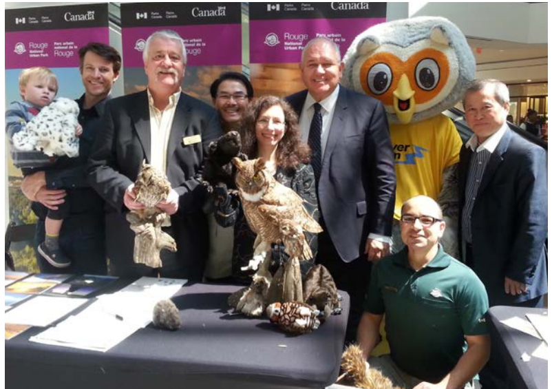
Markham Environmental Advisory Committee's Earth Month Celebrations

A few events from early 2016 include participating in the Toronto and Region Conservation Authority's 60th anniversary celebrations, as well as having a presence at the City of Pickering's Environmental Discovery Day, the Durham District School Board's Sustainability Conference, and the Markham Environmental Advisory Committee's Earth Month Celebrations.