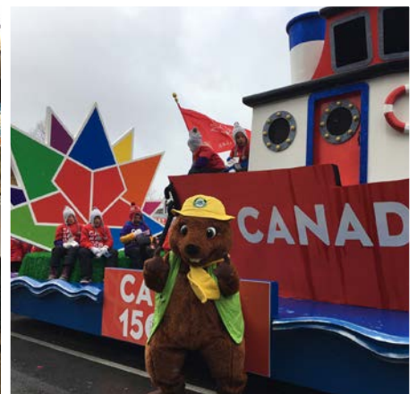
Scenes from Parks Canada's participation in the "Reclaiming the City" photography exhibition, the Great Lakes Public Forum and the 2016 Toronto Santa Claus Parade