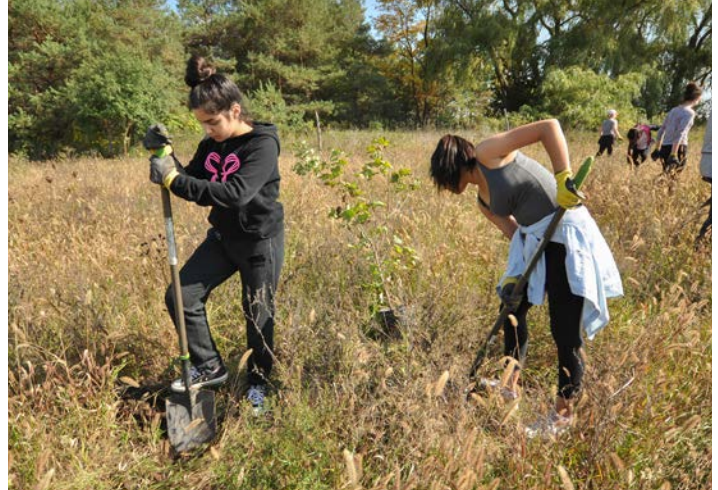
School groups planting trees in the Rouge

The goal of these projects is to improve water quality and aquatic habitat, including the reduction of soil erosion and ultimately the restoration of habitat suitable for important cool and cold water fish species that historically existed in the park. The work also helped to enhance the function of farmland in the park, including improving farm drainage and reducing the loss of valuable agricultural soils.