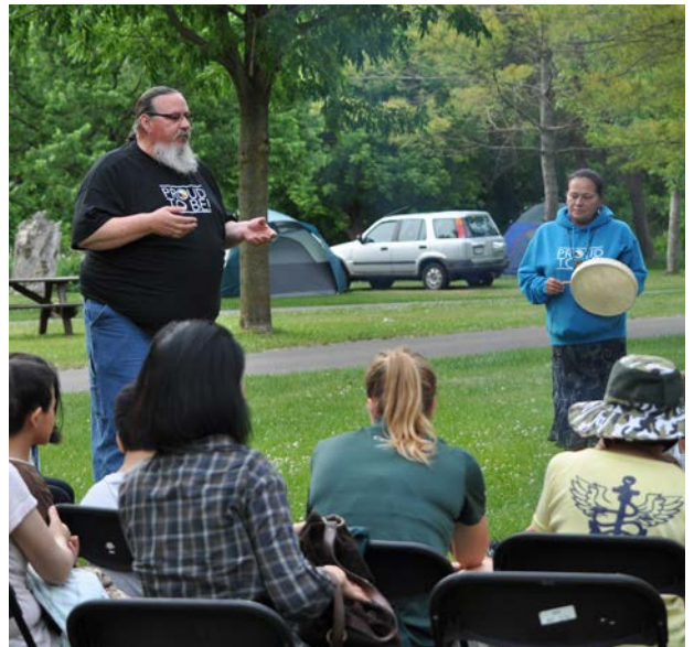
Storytellers from Hiawatha First Nation

Parks Canada also partnered with Ontario Power Generation, the Toronto and Region Conservation Authority, Toronto Zoo and others to host this past year's Fall Walk Festival in the Rouge. The event, which featured fun and fascinating outings with our award-winning walk leaders, also included special guest educators from the Royal Ontario Museum, Bird Studies Canada and the City of Markham. Parks Canada was also delighted to once again work with the non-profit Parkbus service to provide a free shuttle from downtown Toronto for the Fall Walk Festival for hundreds of first-time visitors to Rouge National Urban Park.