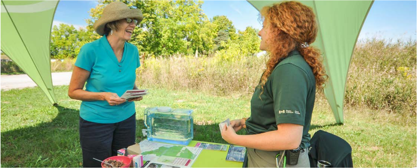
Taste of the Trail at Bob Hunter Memorial Park

This past year was an exceptional second operational season for Parks Canada's Visitor Experience team in Rouge National Urban Park. In addition to having two welcome areas open throughout the summer season to serve our guests, Parks Canada collaborated with community and Indigenous partners to host more than 300 free in-park events throughout 2016. These events enabled thousands of Canadians, GTA residents and visitors to explore, connect with and celebrate the diversity of the Rouge's unique natural, cultural and agricultural landscapes.