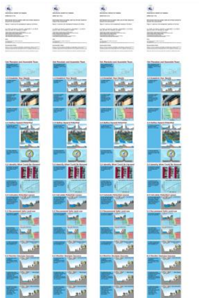
Figure rm3. File of_7772_fig2_poster_multi.pdf contains a plot file with four posters of figure 2 arranged as letter page width and 54" long designed for a custom plotter page width of 36" and length of 55".