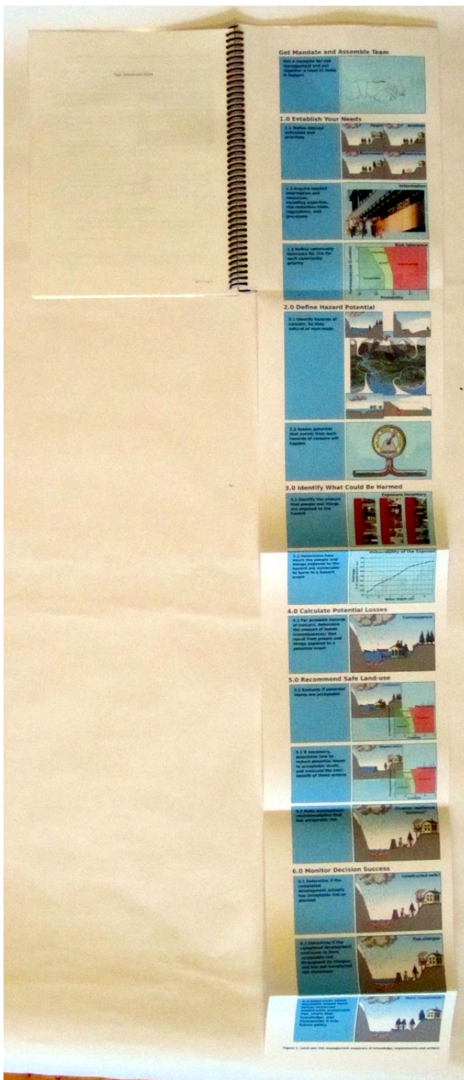
Figure rm1. Shows the figure 2 vertical tip-in unfolded.