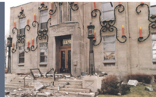
Former Montreal-East City Hall suffered damage to the masonry cladding, 1988.

In November 1997, another significant event (M5.2) occurred about 15 kilometres west of Quebec City. Minor damage occurred in the area around the epicentre.