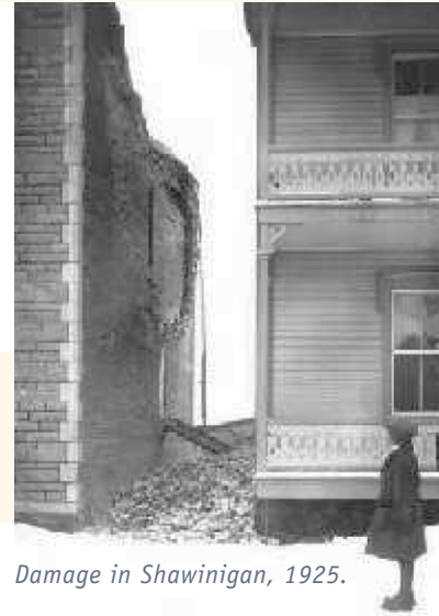
Damage in Shawinigan, 1925.

4. Northern Appalachians - This area includes most of New Brunswick and some of New England. A series of significant earthquakes have occurred here, including a M5.7 in the Miramichi area of central New Brunswick in 1982.