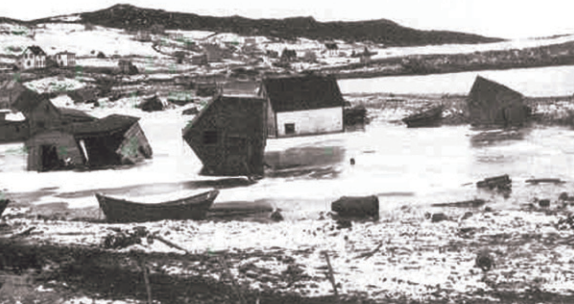
Buildings in Lord's Cove, Newfoundland tossed and smashed by the tsunami, 1929.

5. Laurentian Slope - This is an area off Canada's east coast, 250 kilometres south of Newfoundland. In 1929, a M7.2 earthquake here triggered a huge underwater landslide in the Atlantic Ocean. The landslide generated a tsunami which killed 28 people on Newfoundland's Burin Peninsula. This is one of the few recorded earthquakes which caused deaths in what is now Canada (Newfoundland did not join Confederation until 1949). This earthquake is also known as the "Grand Banks" Earthquake, even though it occurred west of the Grand Banks fishing region.