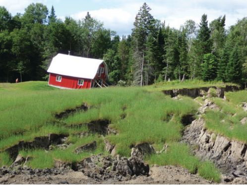
A landslide triggered by the 2010 Val-des-Bois earthquake.

1. West Quebec - This area includes Montreal and extends northwest, across the Ottawa River to eastern Ontario. Some notable earthquakes in this area include - the Timiskaming, Quebec magnitude M6.2 earthquake of 1935, which was felt over an area of one million square kilometres; and the Cornwall, Ontario M5.8 earthquake of 1944 which caused almost 26 million 2009 dollars worth of damage. Recent moderate earthquakes in this region include a M4.7 near Timiskaming in 2000; a M5.1 near Plattsburgh, New York in 2002; and a M5.0 near Val-des-Bois, Quebec in 2010. Each of these events caused some damage in their immediate vicinities and were widely felt in southern Ontario and Quebec.