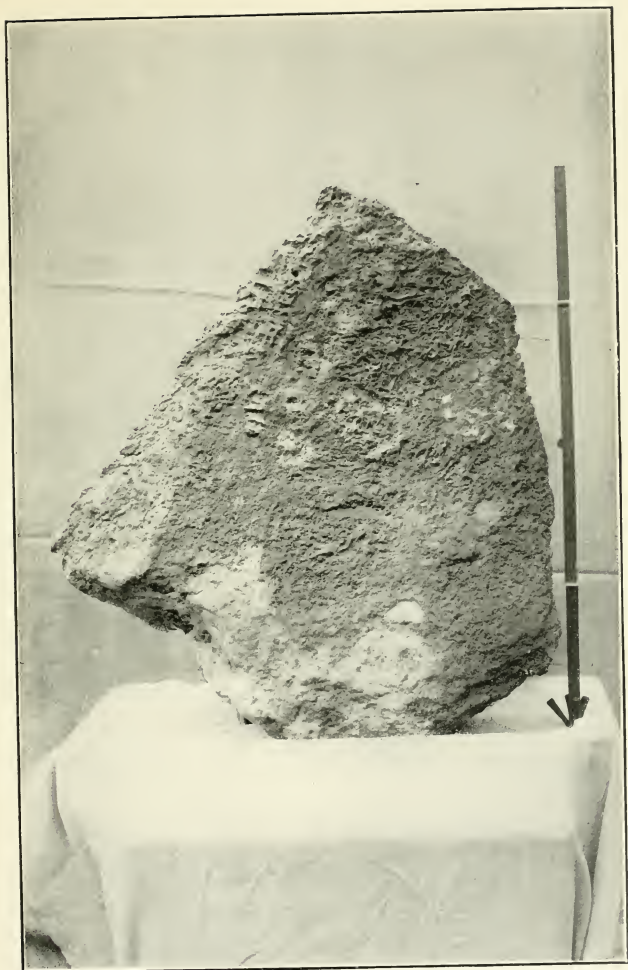
SILVER NUGGET FROM THE LAROSE MINE, COBALT.