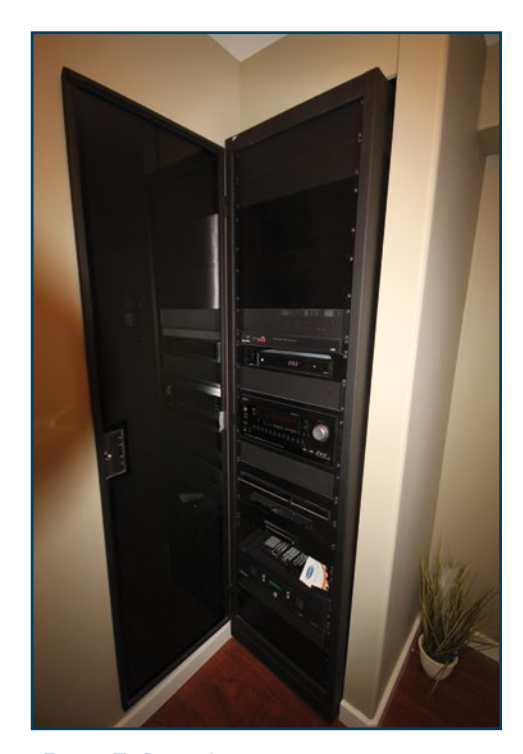
Figure 7: Central entertainment centre