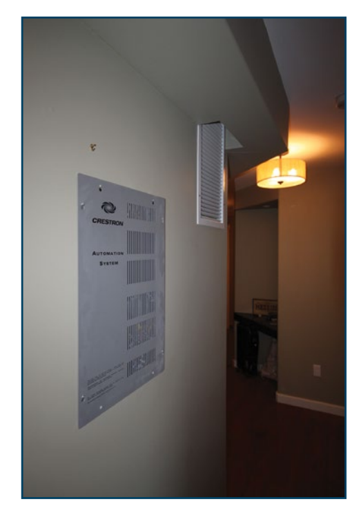
Figure 6: Central control panel

Electrical panels are often installed in the basement or some out-of-the-way corner, but homeowners that cannot make it up and down the stairs may not be able to access them if a breaker trips or the power goes out. Consider moving the panel to the garage and installing it at a wheelchair-accessible height.