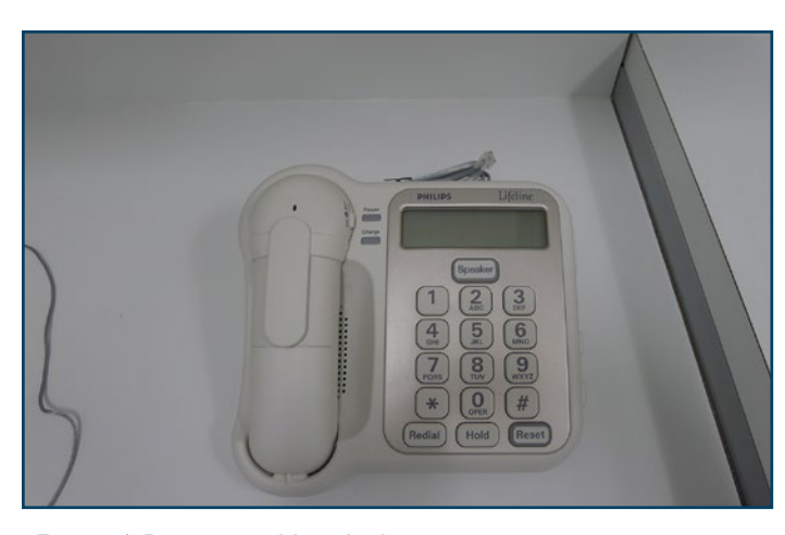
Figure 4: Programmable telephone

Some telephones can be programmed to ring a unique tone when the doorbell or intercom button is pressed. If you are on the telephone, a unique call-waiting tone