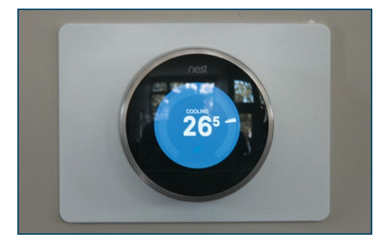
Figure 3: Programmable thermostat

Some cooling systems can be programmed to turn off the air-conditioning system when an open window is detected and turn the system back on when all the windows are closed.