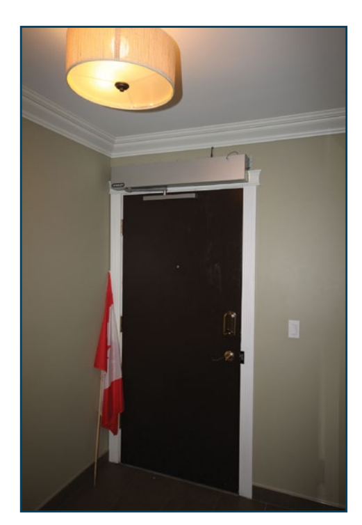
Figure 5: Remote control door opener

What would you do if you were at the store when a sudden thunderstorm started and you had left your windows open? What if you had a disability and limited strength and could not close the windows yourself? Windows can be closed remotely by your home automation system and they can even be programmed to open automatically when the thermostat registers a certain temperature.