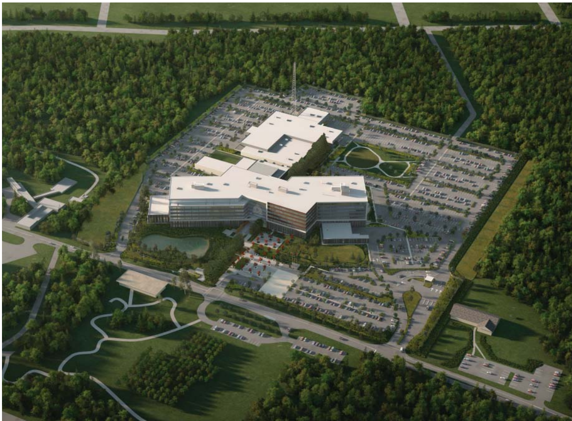
GTAP Artist Rendering of Future RCMP E Division HQ

The final VfM analysis from PricewaterhouseCoopers post-financial close found that the Project Agreement reached with Green Timbers Accommodation Partners resulted in a $68 million savings (net present cost) to the Government of Canada compared to what traditional methodologies would have provided.