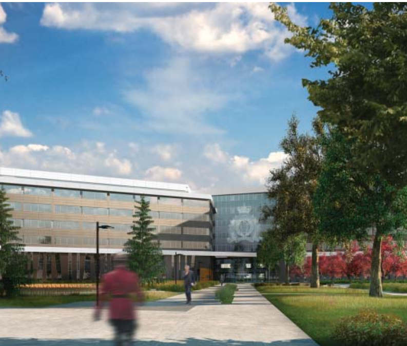
GTAP Artist Rendering of Future RCMP E Division HQ

As part of the Project Agreement, the private partner has agreed to a fixed budget and time schedule with any increase in material costs or delays in construction being its responsibility. The Agreement provides for strong financial incentives to the private partner for timely delivery, giving the Government additional certainty that the Project