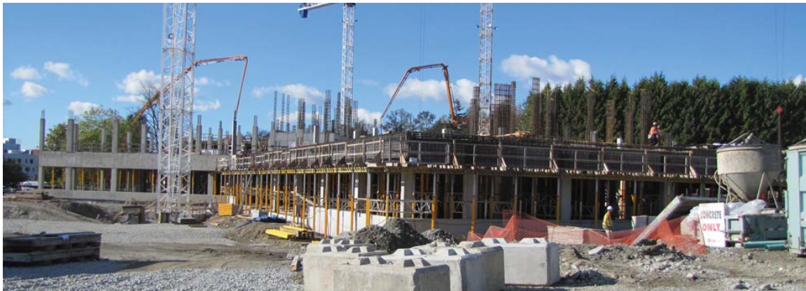
Construction of the new RCMP E Division Headquarters (October 15, 2010)

The need for a new E Division Headquarters facility was first identified over 20 years ago. That need is now critical and a new facility is required in order to maintain operational efficiency. The existing facilities, which date from 1912 onward, are neither purpose-built nor suitable in terms of space, adjacencies, systems and technology. The current locations and aging facilities do not adequately support RCMP service delivery requirements and are no longer sustainable.