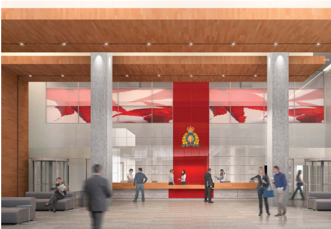
GTAP Artist Rendering of Future RCMP E Division HQ