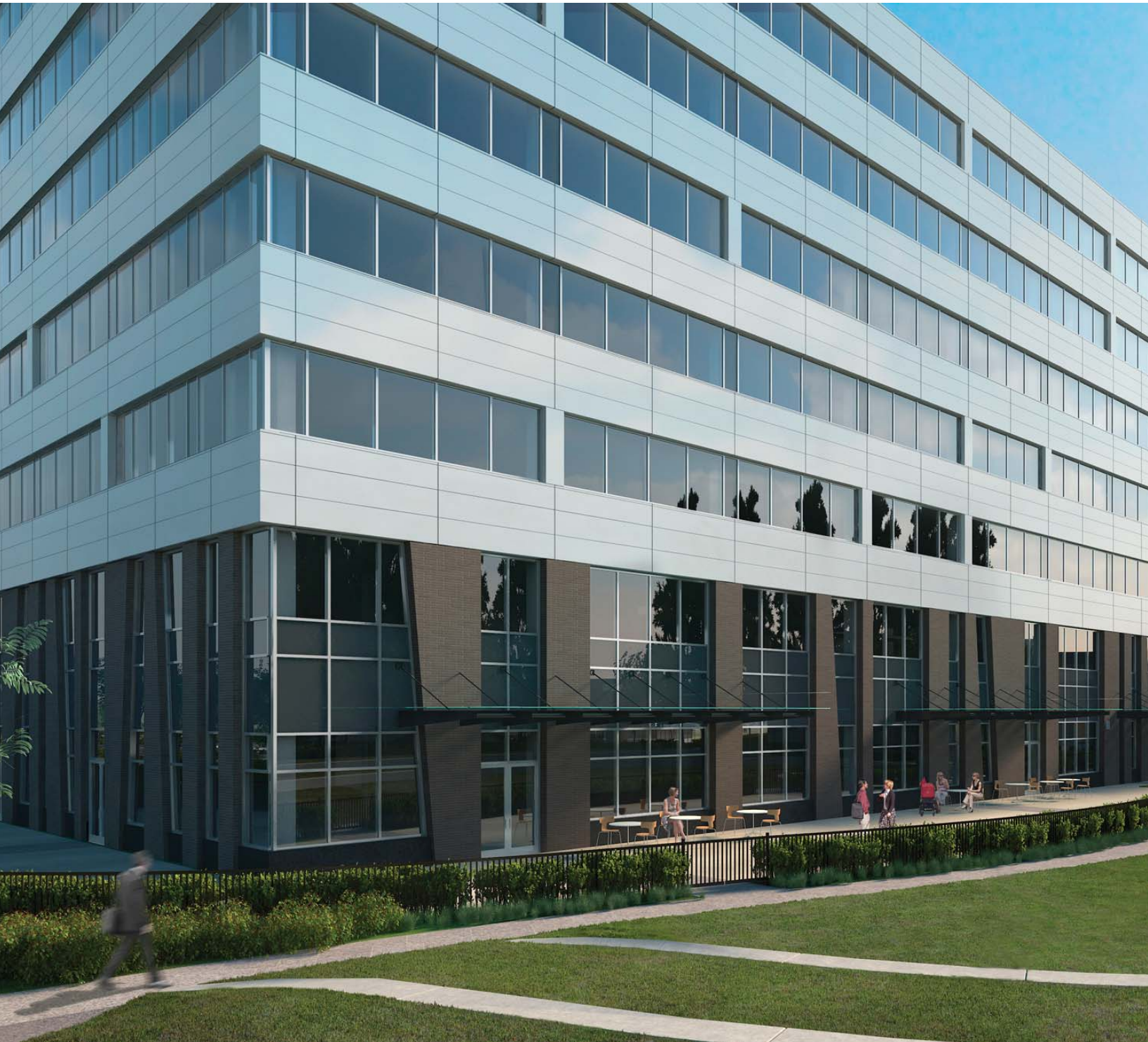
GTAP Artist Rendering of Future RCMP E Division HQ

In this case, the P3-DBFM approach has also allowed the Government to fund the Project within existing allocations of both PWGSC and the RCMP, with no additional resources being requested from the Government's fiscal framework.