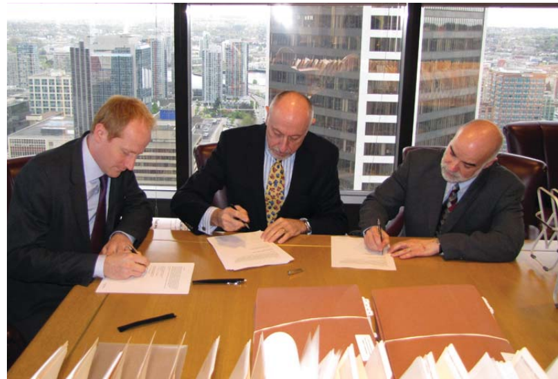
Signing of the Project Agreement.

performance-based Agreement, a payment mechanism has been established whereby Green Timbers Accommodation Partners incurs deductions for service failures and space unavailability. The level of deductions would be proportional to the severity and frequency of the non-performance.