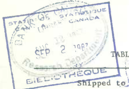
TABLE 1. Domestic Shipments of Rigid Insulating Board