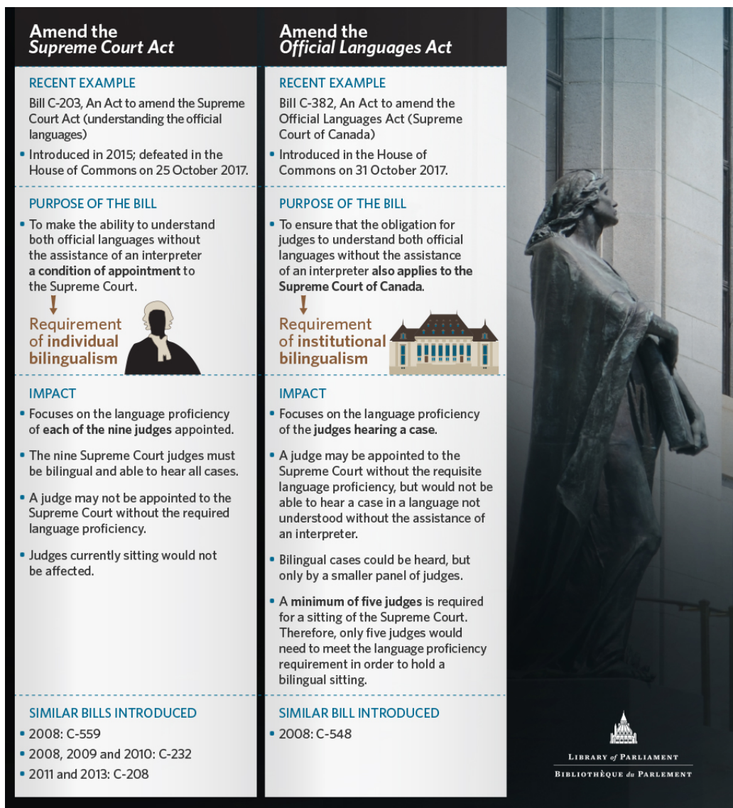
Figure 3 – Proposed Measures to Promote the Appointment of More Bilingual Judges to the Supreme Court

Sources: Bill C-203, An Act to amend the Supreme Court Act (understanding the official languages) , 1 st Session, 42 nd Parliament; and Bill C-382, An Act to amend the Official Languages Act (Supreme Court of Canada) , 1 st Session, 42 nd Parliament.