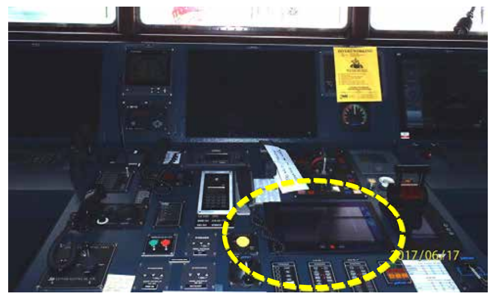
Figure 2. Centre bridge console on the Damia Desgagnés , showing the horizontal mounting location of the integrated touch screen that was activated and caused the accidental main engine shutdown

When the main engine shutdown button was activated on the touch screen, a generic system status message appeared on the touch screen, stating "SLOWDOWN alarm. CANCELLABLE UNIC<sup>2</sup> SLOWDOWN REQUEST[.] Engine speed will be reduced in 60 sec" (Figure 3). The message did not specify that the engine was about to shut down, nor did it indicate how the shutdown was activated or from where (bridge, engine room, emergency stop, etc.).<sup>3</sup>