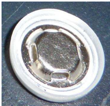
Figure 2.1: Header of a cylindrical lithium battery

Prolonged exposure to condensation resulting from temperature fluctuations in humid environments, especially in salt environments, may corrode the lithium battery header 3 (Figure 2.1) and/or the monitoring circuit (Figure 2.2) creating the potential for external shorts.