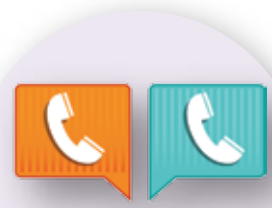
Making a phone call