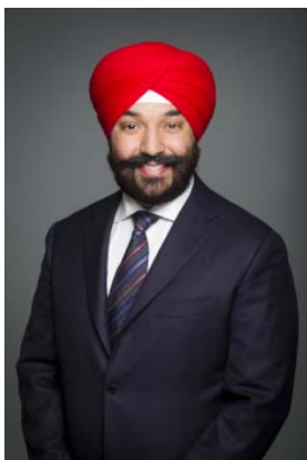
The Honourable Navdeep Bains Minister of Innovation, Science and Economic Development

It is my pleasure to submit the Departmental Plan 2018–19 for Canada Economic Development for Quebec Regions.