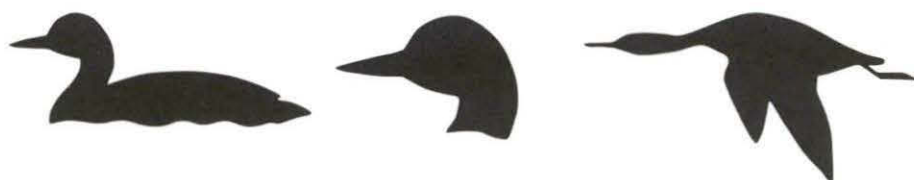
Left: swimming profile; centre: profile of alarmed loon, which may sink slowly into the water, leaving only the neck and head above water; right: flight profile

Hunting, feeding, resting, preening, and caring for young are the loon's main activities. The bird spends long rest periods motionless on the water. It may rouse itself to stretch a leg or wing at intervals, occasionally comically waggling a foot. When swimming on top of the water it