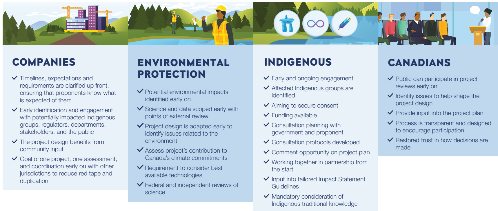
FIGURE 2 – RESULTS OF EARLY PLANNING AND ENGAGEMENT