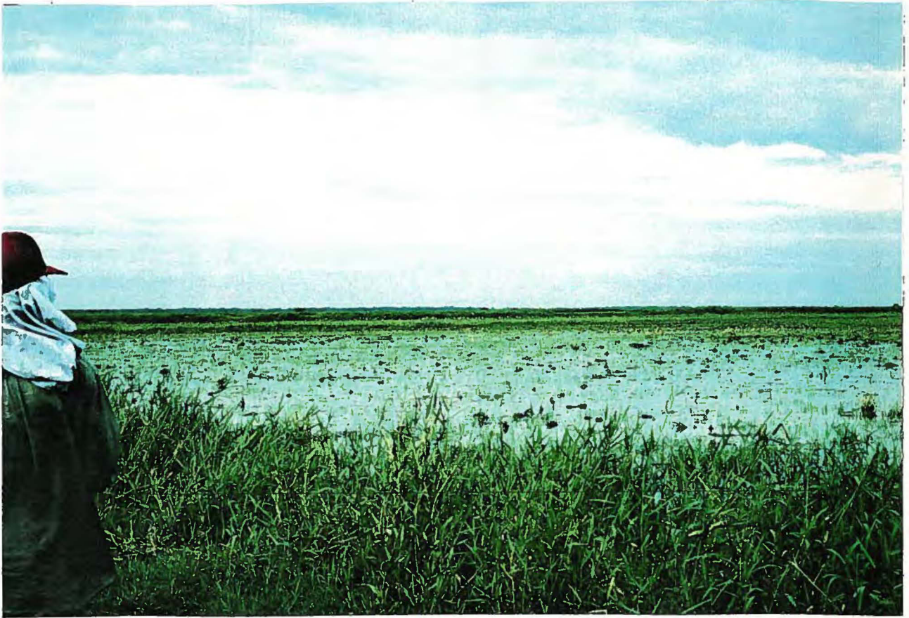
Figure 1. Technician at a newly-seeded rice field.