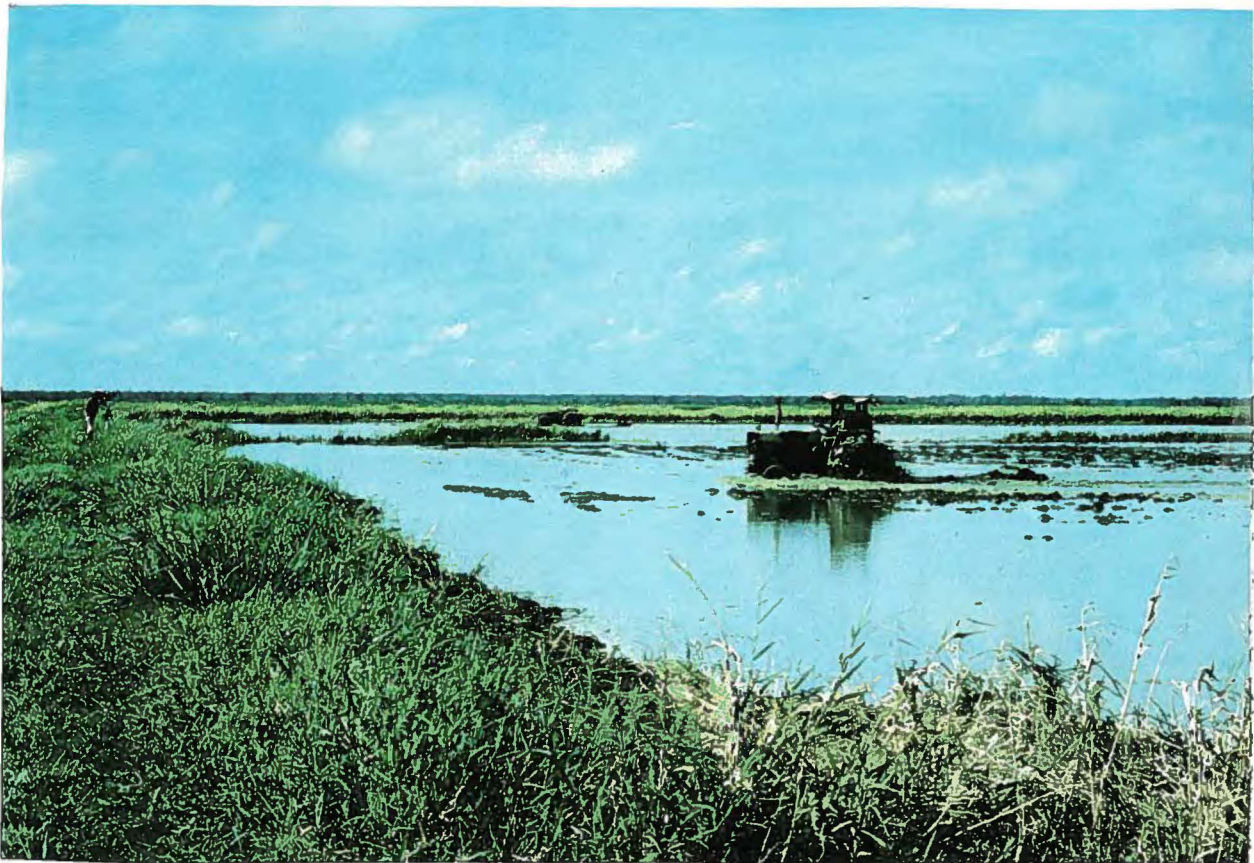
Figure 4. Harvested rice field being plowed and Arie Spaans (left) counting birds.