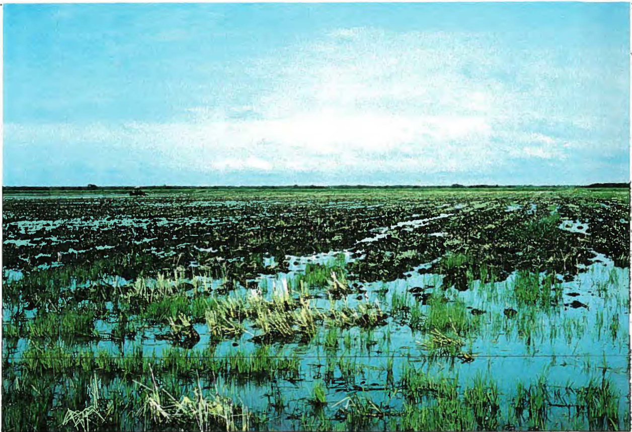
Figure 3. Recently-harrowed rice field with tractor and harrow in adjoining field (upper left).