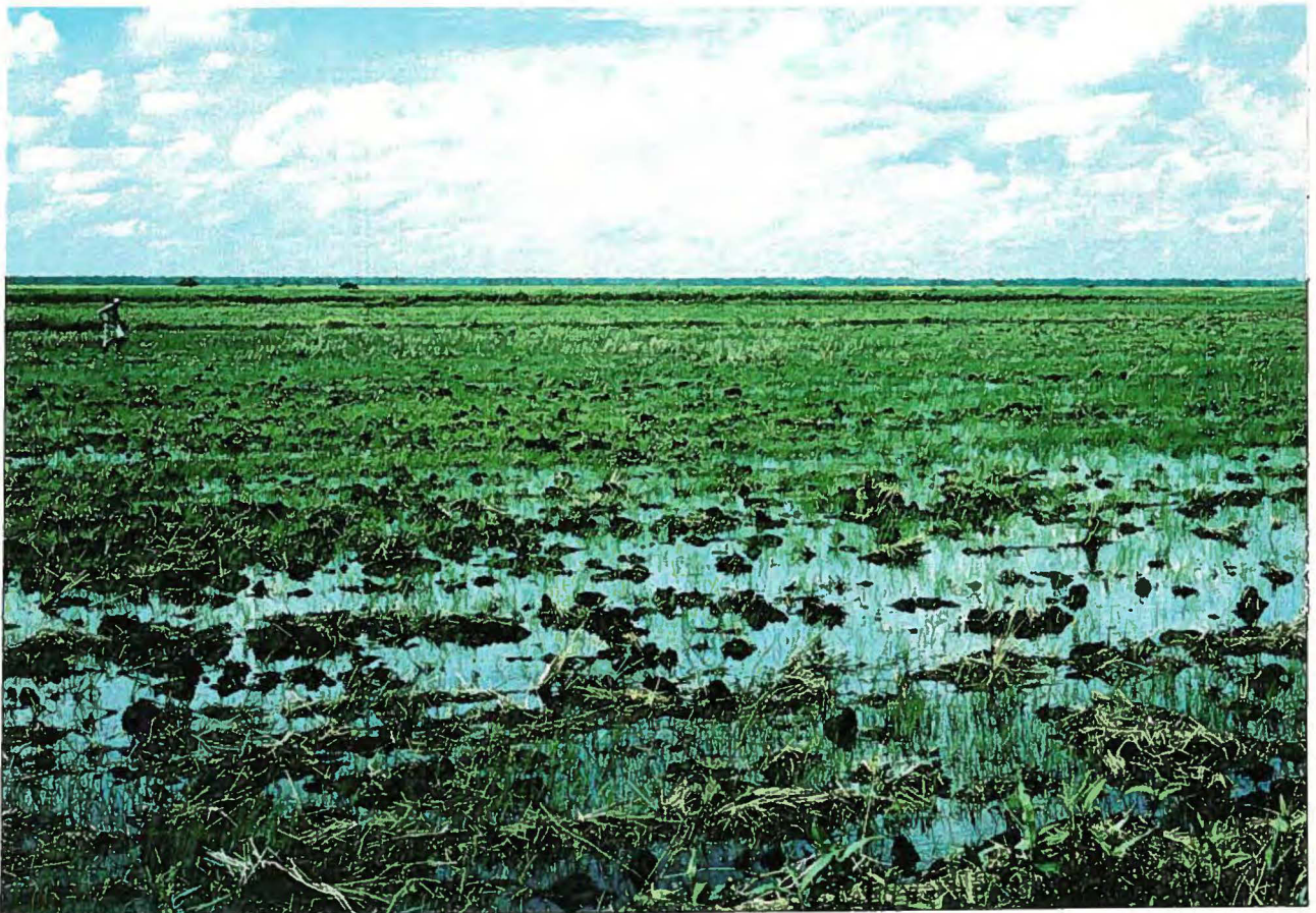
Figure 2. Arie Spaans searching for shorebirds in newly-seeded rice field.