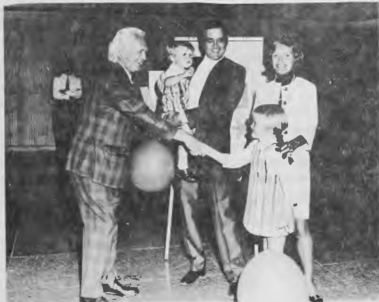
The day, complete with balloons and refreshments, turned out to be a most enjoyable one for all concerned.