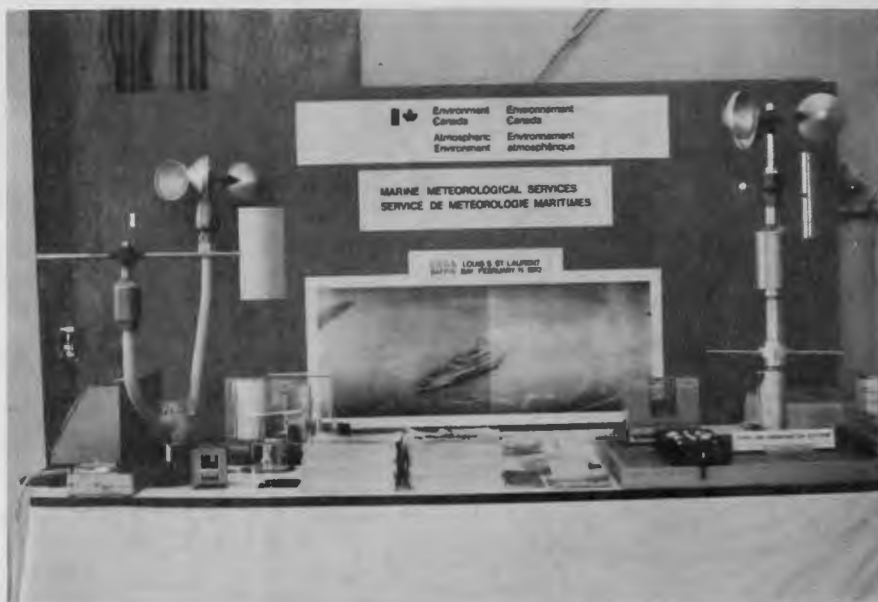
A.E.S. Display at CCG Open House.