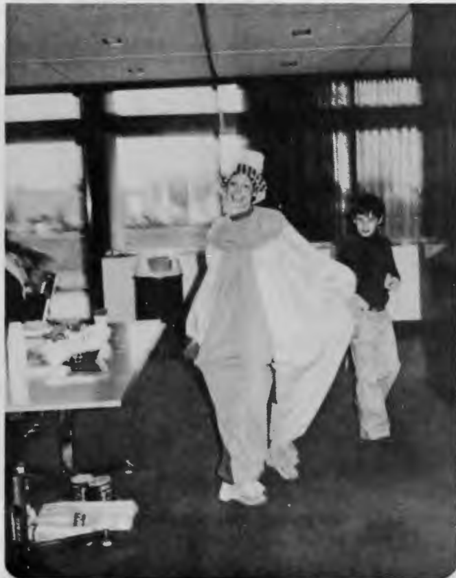
Forever clowning – a real Cookie!