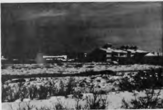
Federal apartment block and hospital residence for employees.