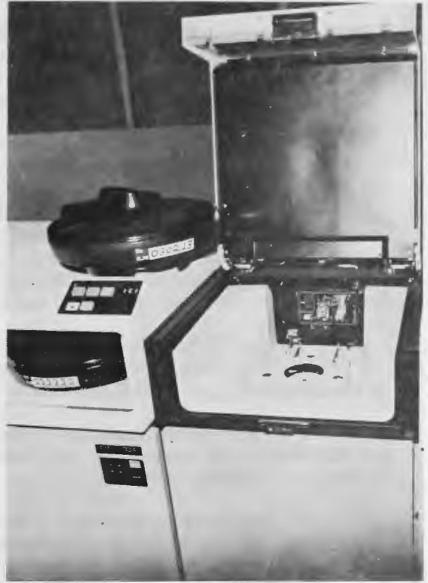
The IBM 370/135 is four to seven times faster than older models, with less than one-twelfth of the cost increase.