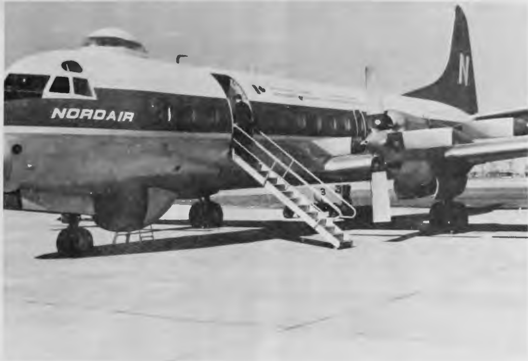
CF-NAY at CFB, Downsview.