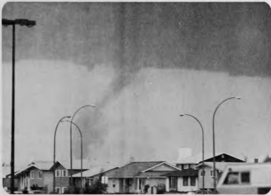
And develops . . . se transforme . . .