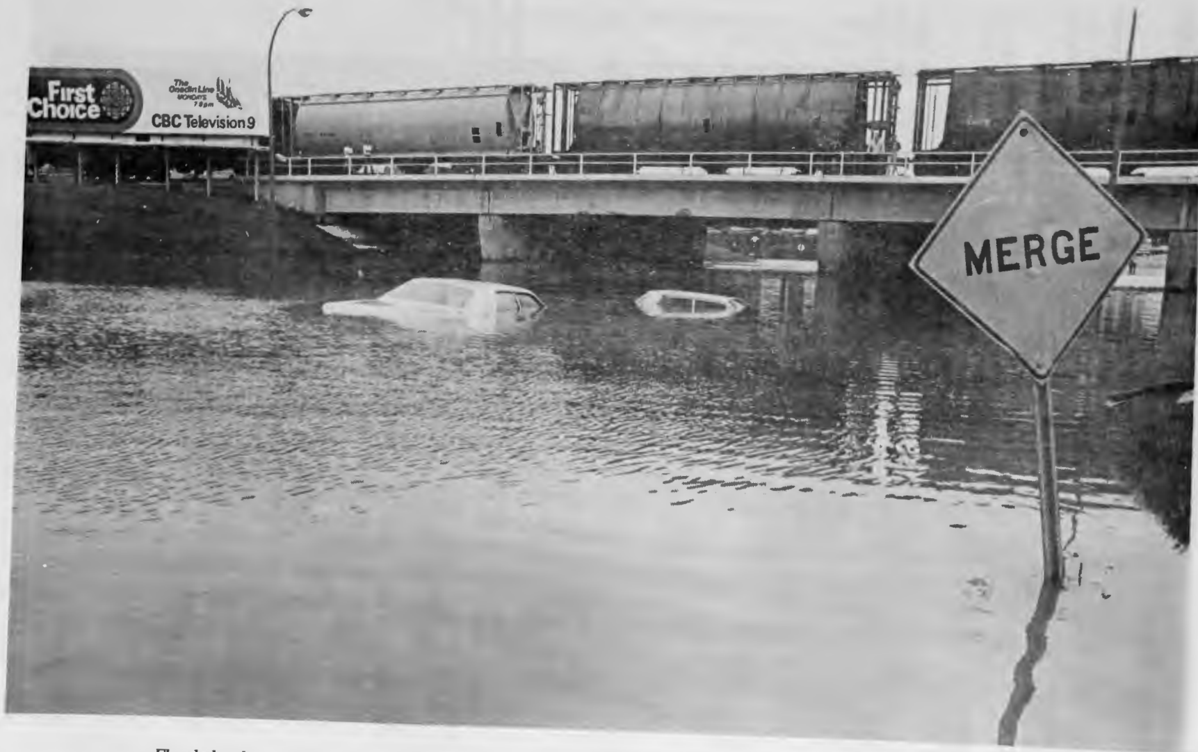
Flooded subway in Regina, Saskatchewan on June 26, 1975 following a 5.98 inch rainfall in a 6 hour period. Un métro inondé à Régina, en Saskatchewan, à la suite d'un volume de précipitations de 5,98 pouces en 6 heures, le 26 juin 1975.