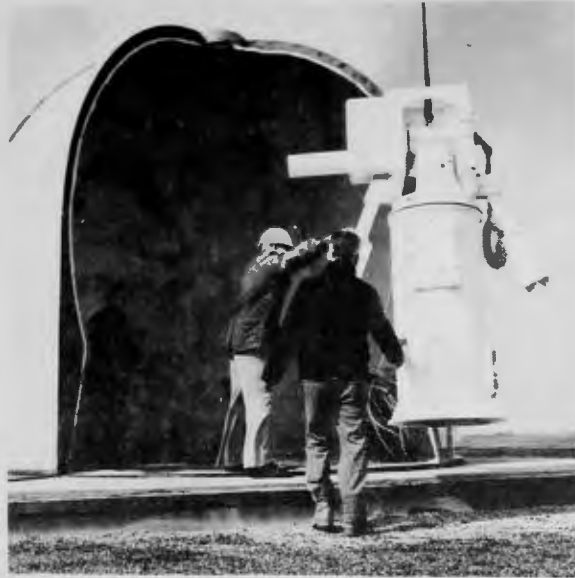
"S" Band antenna pedestal ready to be swung by crane into fibre glass dome on core #5 at AES HQ. Le socle de l'antenne d'une longueur d'ondes de 1 697 Mhz est prêt à être monté par la grue dans le dôme en fibre de verre situé à l'angle n° 5 de l'administration centrale du SEA.