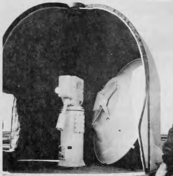
Pedestal and parabolic dish antenna awaiting mounting after the dome has been re-assembled. Le dôme a été réassemblé: il ne reste plus qu'à monter le socle et l'antenne parabolique.