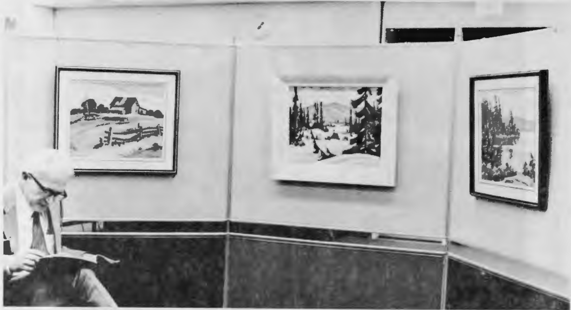
Some paintings in Exhibition. Quelques toiles exposées.

A collection of 44 oil paintings by Les Tibbles has been on display in the library at AES HQ. The group includes a wide range of subjects from abstracts to woodland sketches and snow scenes.