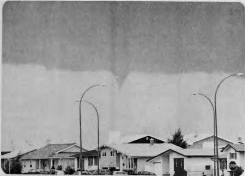
One funnel cloud begins to decay while a second one forms. ... Une nuage en entonnoir se dissipe, un autre se forme . . .