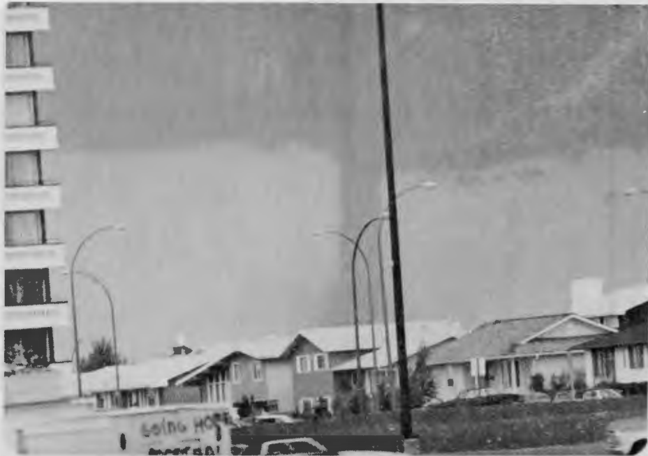
And brushes by the city . et frôle la ville.