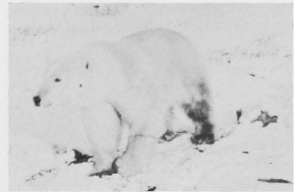
Being visited by a polar bear at an upper air station can be a "nightbearish" experience, even at Churchill, Man. the polar bear capital of Canada.

The plane in which we made the search was supposed to do a caribou inventory, so on the way back to Kuujuaq we tried to locate the herd. Despite our efforts, we only saw ten caribou at most. Then, as we were preparing to land we suddenly saw thousands of caribou crossing the river from east to west. The biologists were surprised because the animals usually go from west to east. For three days we watched countless caribou pass the village.