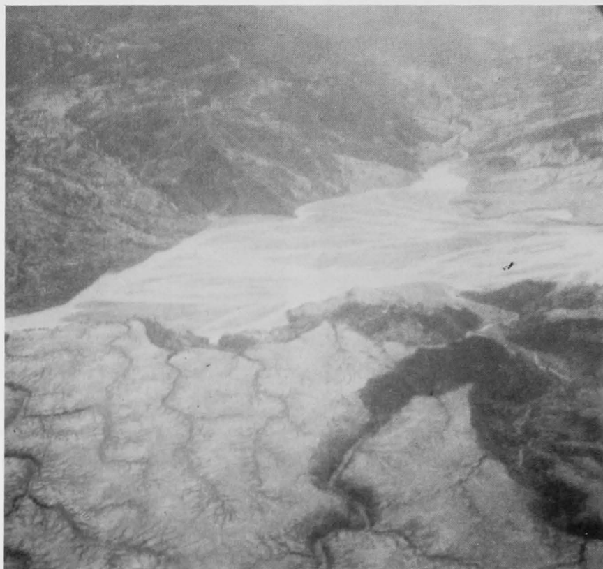
View from a light aircraft: a devastated, ash-clogged valley near the El Chichón crater.

I was told I could drive right by the volcano via a scenic route leading to Tuxtla Gutierrez, the state capital. First I headed for Pichucalco, an attractive small town only 23 km from El Chichón. I soon realized that driving in the vicinity of a recently active volcano would not be easy. Twice I was diverted on to muddy tracks by signs that read "Road rinsing in progress". Apparently, it was necessary to wash the ash right out of the asphalt surface to prevent further corrosion. When I reached Pichucalco, I went straight to the town hall, to find out just what roads were like near El Chichón. A municipal employee told me all highways were closed to private traffic.