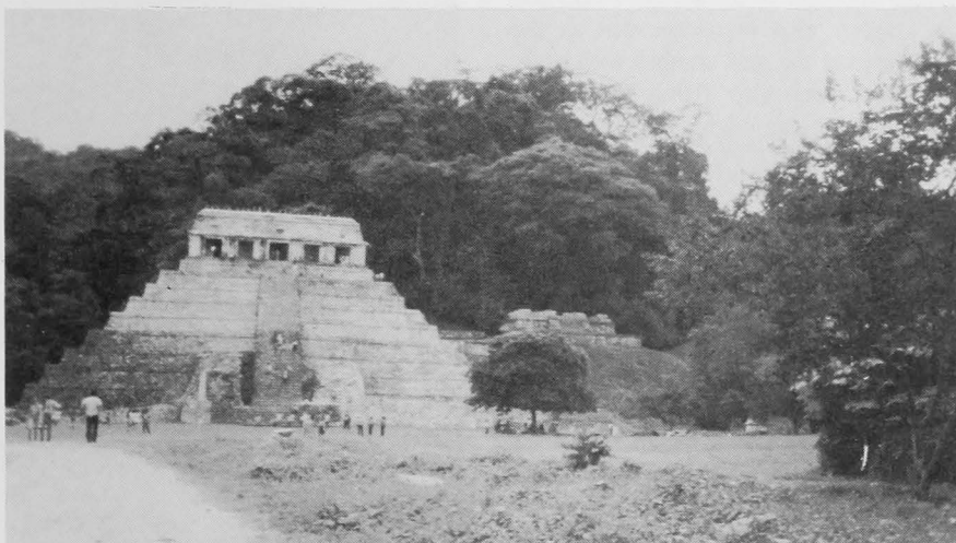
Despite being only 80 km from El Chichón the Mayan ruins at Palenque did not suffer any ill effects.