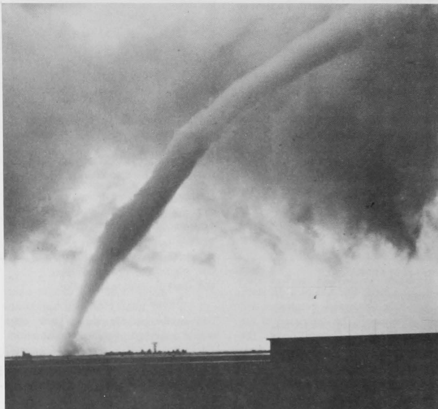
The flat terrain of Winnipeg International Airport provides a striking setting for this typical funnel-cloud tornado.

In compliance with North American convention, special terminology is now used to warn localities of possible severe weather events. The familiar "Weather (contd on p. 9)