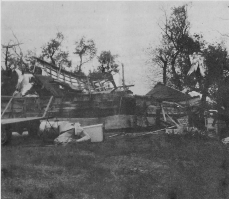
A tornado severely damaged this Yorkton, Sask. farm.

From May through September this year AES had the special problem of forecasting and warning Canadians of severe summer weather — thunderstorms, hail, torrential rain, and tornadoes, all threatening people's lives, property and livelihoods.