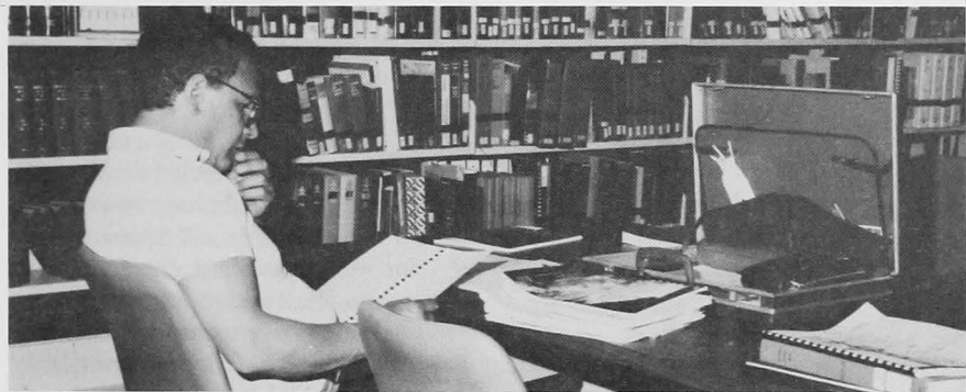
Library users in all AES branches can do quiet research on their own in the library.