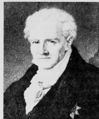
Alexander von Humboldt

Sites selected were Canada, Van Dieman's Land (Tasmania), St. Helena (Atlantic), and the Cape of Good Hope. (This latter was noted for its magnetic peculiarities.) Responsibility for the project was given to the Army Ordnance Corp who farmed it out to the Royal Artillery. Observers were trained at the newly constructed observatory in Ireland and instruments were quickly improved to standards of reasonable accuracy.