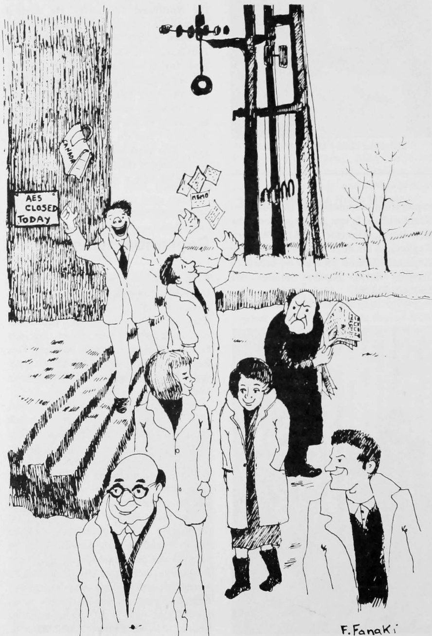
"Dammit! Nowhere to read the paper today".

*See item on 10th anniversary of AES building snow-in.