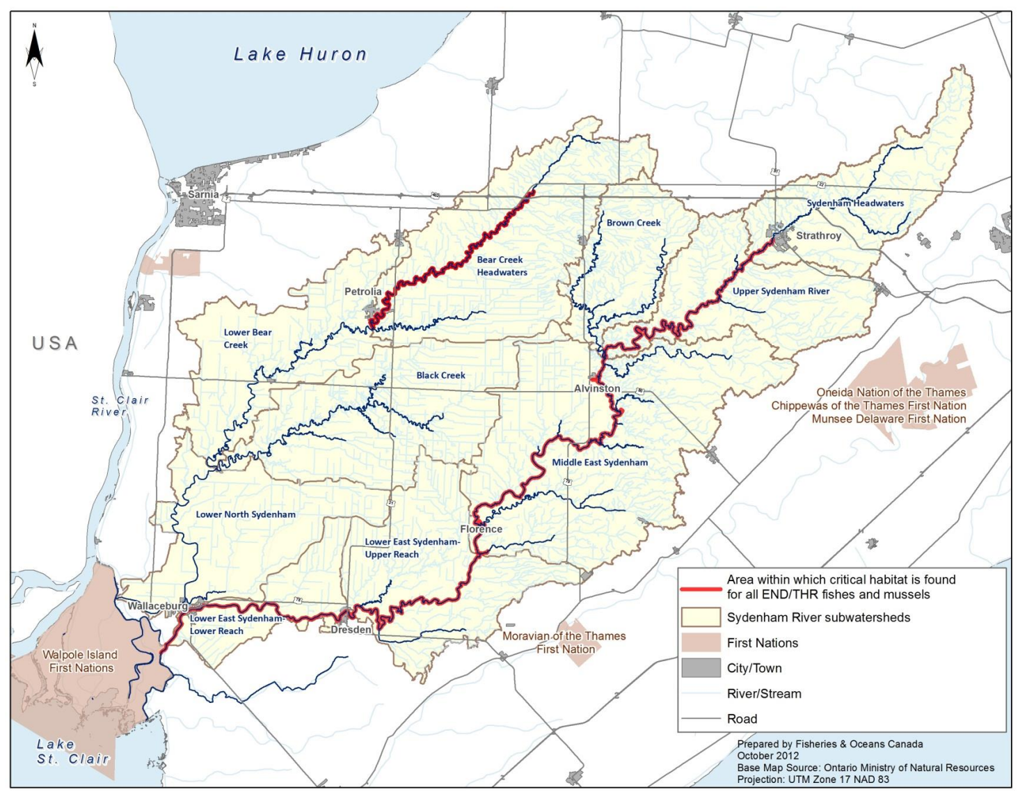
Figure 2. Areas within which critical habitat for fishes and freshwater mussels may be found in the Sydenham River watershed. To be used for illustrative purposes only – for more detail refer to relevant recovery strategies.