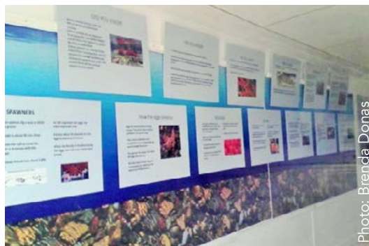
Mobile salmon centre

Lake Babine Nation (LBN) Fisheries Program is