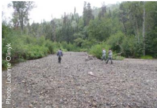
Twain Creek gravel deposits

Monitoring snow pack would assist with predicting summer water level and flow. Managing flows out of Fulton River Spawning Channels could moderate summer water temperatures. Managing nutrient loads entering Babine Lake may assist with zooplankton composition and abundance for rearing sockeye