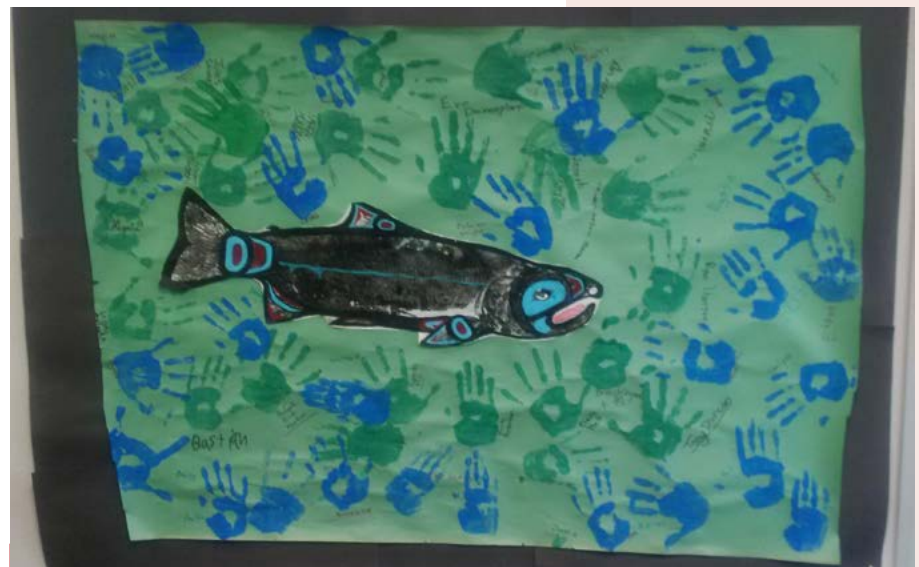
Thornhill Elementary School poster accompanying letters. Each student added their hand print and signature. The illustration of a coho salmon stylized with a First Nations treatment was added to the background.