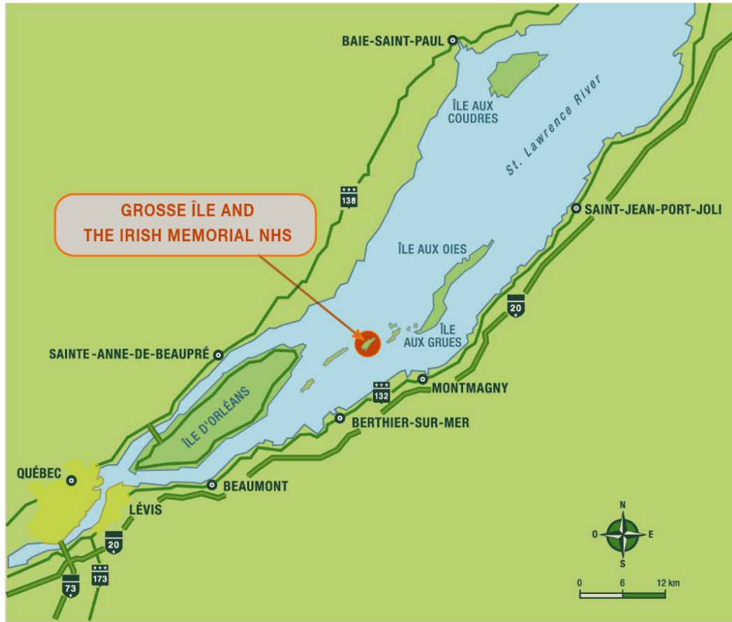
Map 1: Regional Map