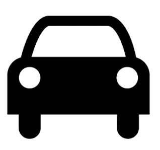
Travel costs that are not covered by the provincial government