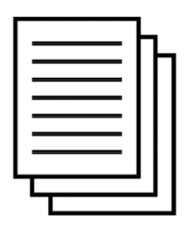
Administrative costs that are not covered by the provincial government

The Lieutenant Governors' Program (LGP) provides LGs with $836,080 in funding each year in the form of a federal grant. This funding can be used to defray costs related to the following elements: