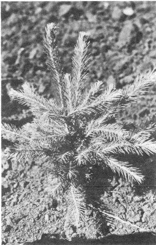
Figure 4. Rejuvenated Habit 3 white spruce seedling showing minor loss in crown and stem form. The forked leaders show normal and abnormal needle development.