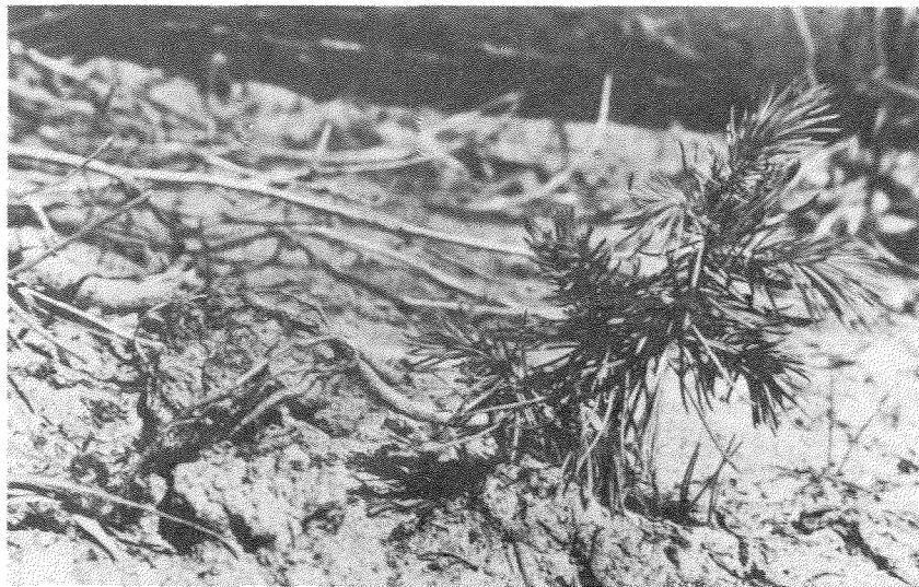
Figure 2. Winter-damaged and frost-heaved white spruce seedling showing late flushing, loss of foliage and terminal bud, and poor rejuvenation of adventitious foliage characteristic of Habit 1.