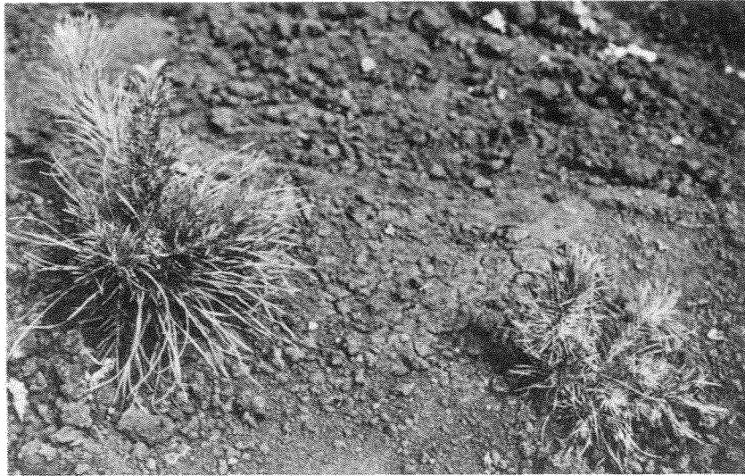
Figure 3. Bushy, multistemmed lodgepole pine seedling showing considerable loss in crown and stem form characteristic of Habit 2.