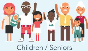
Children / Seniors