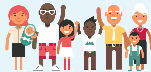
Children / Seniors