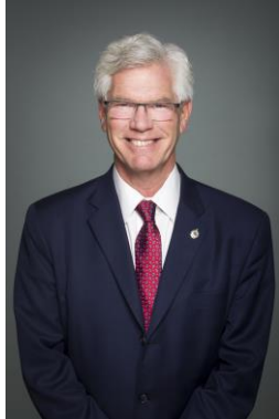
The Honourable James Gordon Carr Minister of International Trade Diversification