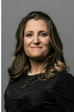
The Honourable Chrystia Freeland Minister of Foreign Affairs