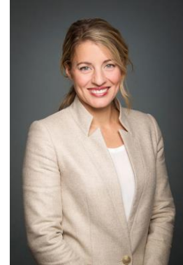
The Honourable Mélanie Joly Minister of Tourism, Official Languages and La Francophonie

Our focus is on Canadians and their interests at home and abroad.