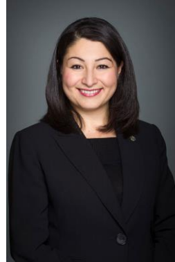
The Honourable Maryam Monsef Minister of International Development and Minister for Women and Gender Equality