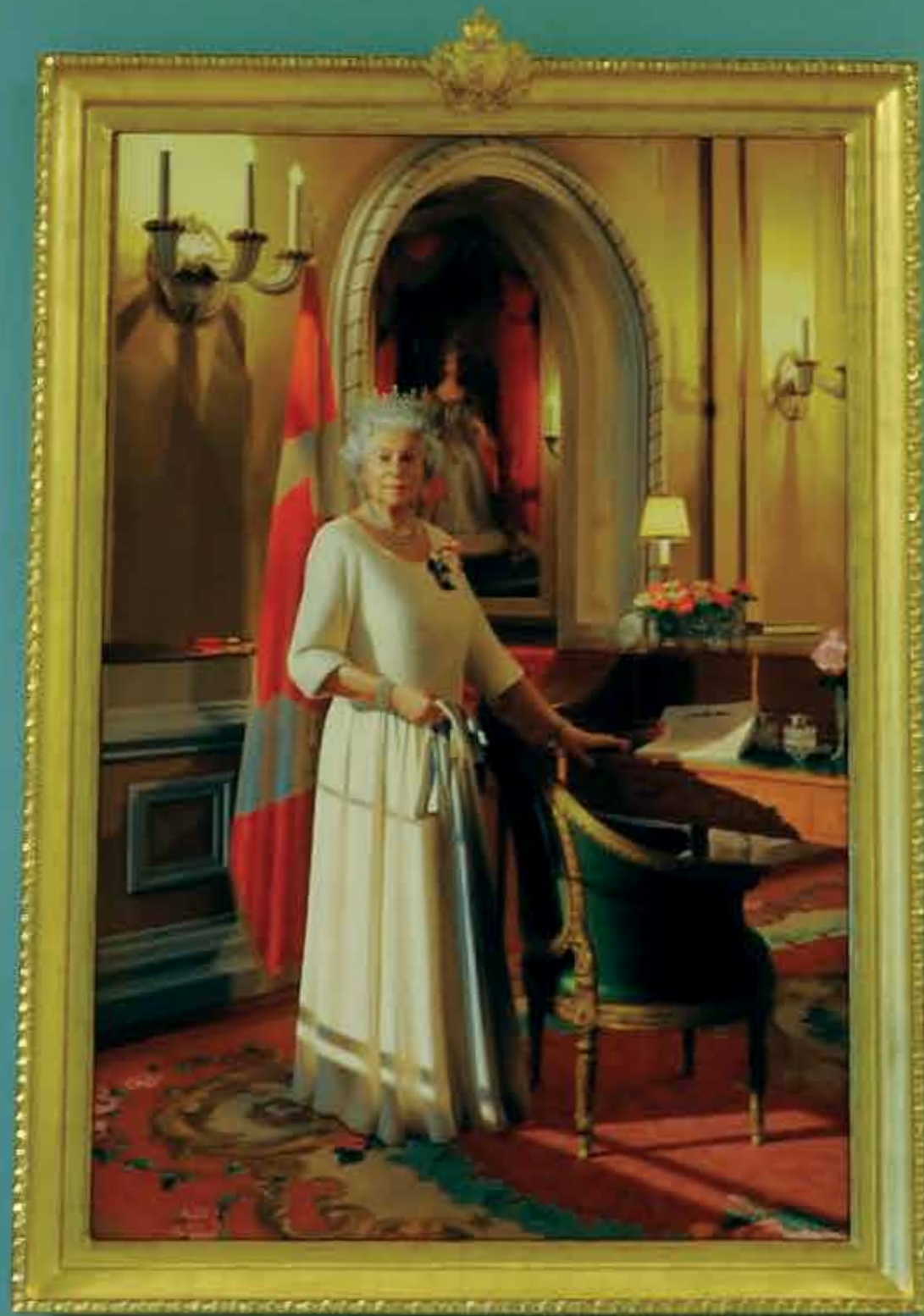
Representing the Crown in Canada