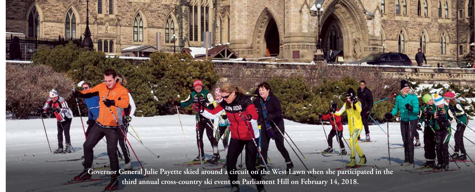
Governor General Julie Payette skied around a circuit on the West Lawn when she participated in the third annual cross-country ski event on Parliament Hill on February 14, 2018.