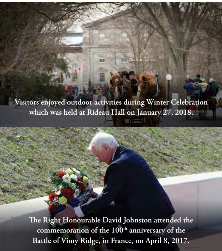
Visitors enjoyed outdoor activities during Winter Celebration which was held at Rideau Hall on January 27, 2018.