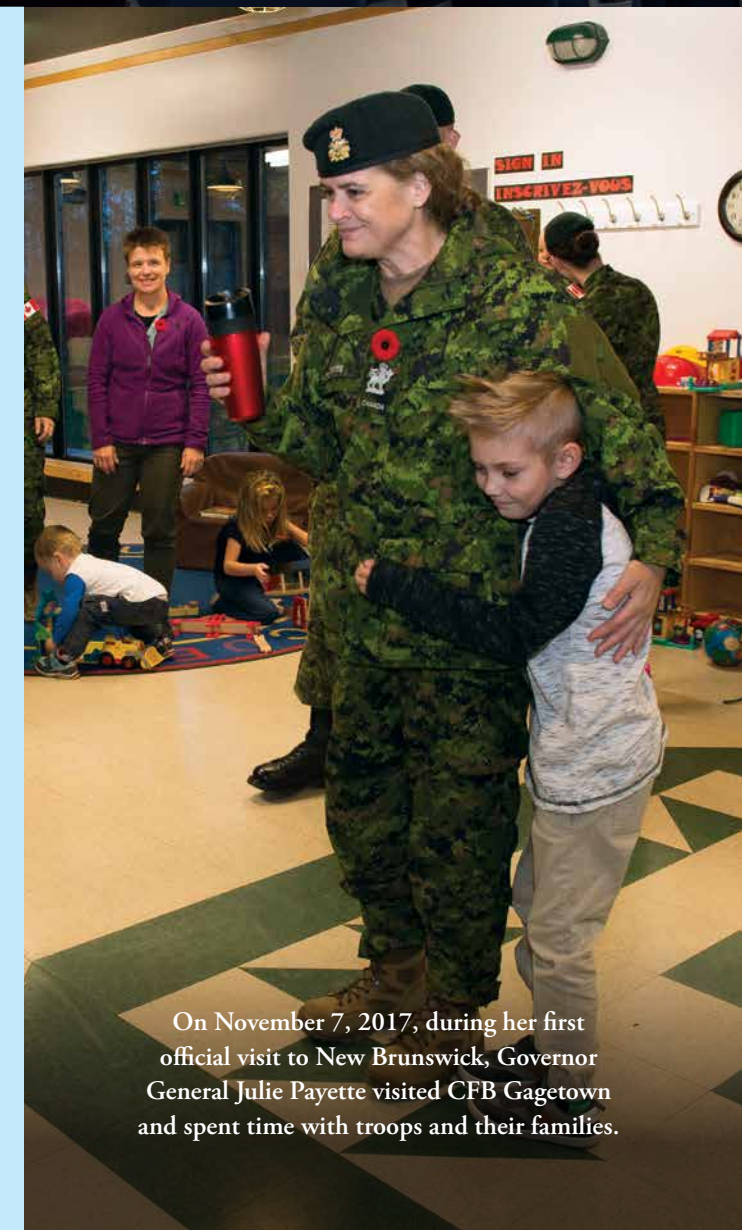
On November 7, 2017, during her first official visit to New Brunswick, Governor General Julie Payette visited CFB Gagetown and spent time with troops and their families.