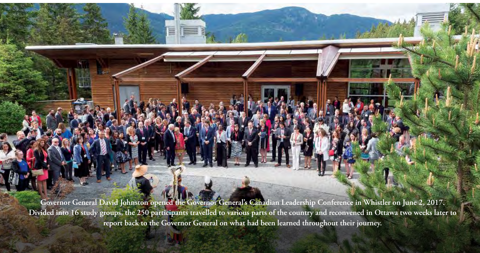
Governor General David Johnston opened the Governor General's Canadian Leadership Conference in Whistler on June 2, 2017. Divided into 16 study groups, the 250 participants travelled to various parts of the country and reconvened in Ottawa two weeks later to report back to the Governor General on what had been learned throughout their journey.