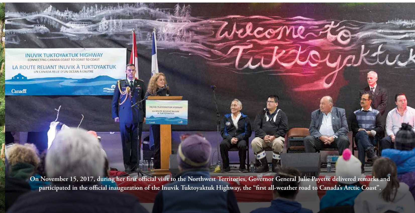
On November 15, 2017, during her first official visit to the Northwest Territories, Governor General Julie Payette delivered remarks and participated in the official inauguration of the Inuvik Tuktoyaktuk Highway, the "first all-weather road to Canada's Arctic Coast".