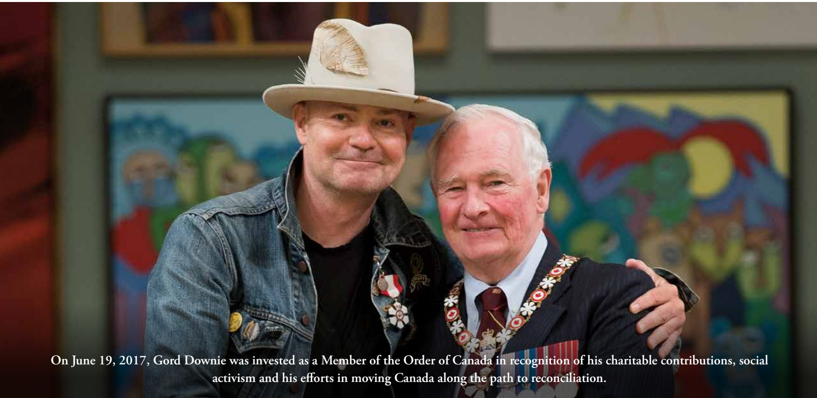
On June 19, 2017, Gord Downie was invested as a Member of the Order of Canada in recognition of his charitable contributions, social activism and his efforts in moving Canada along the path to reconciliation.

“The Order of Canada comprises an extraordinary network of talented, compassionate and dynamic people from right across this vast, diverse land, and yet, like any group of individuals, the Order is much more than the sum of its parts.”