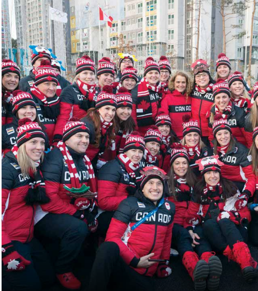
While in PyeongChang for the opening of the Olympic Winter Games, Governor General Julie Payette visited the Athletes' Village and had the opportunity to meet with Canadian athletes.

“It was a great honour to meet Ms. Payette at the PyeongChang Olympic Games. I have tremendous admiration for astronauts because they, too, have to undergo rigorous training to achieve their dreams. I don't know what it's like to be weightless in space, but I imagine it's not far off from the adrenaline rush I felt when I won Olympic gold!”