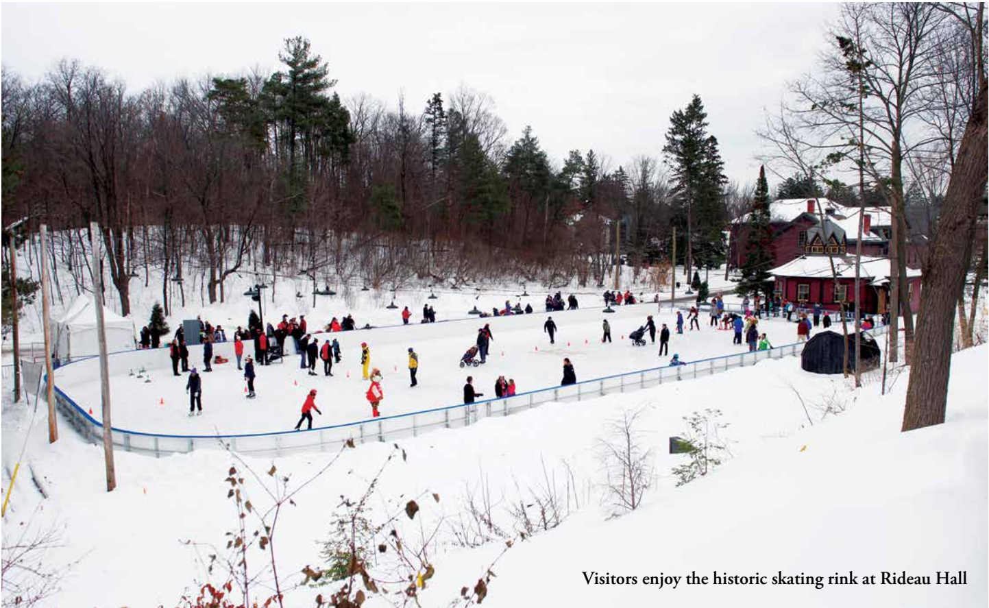
Visitors enjoy the historic skating rink at Rideau Hall