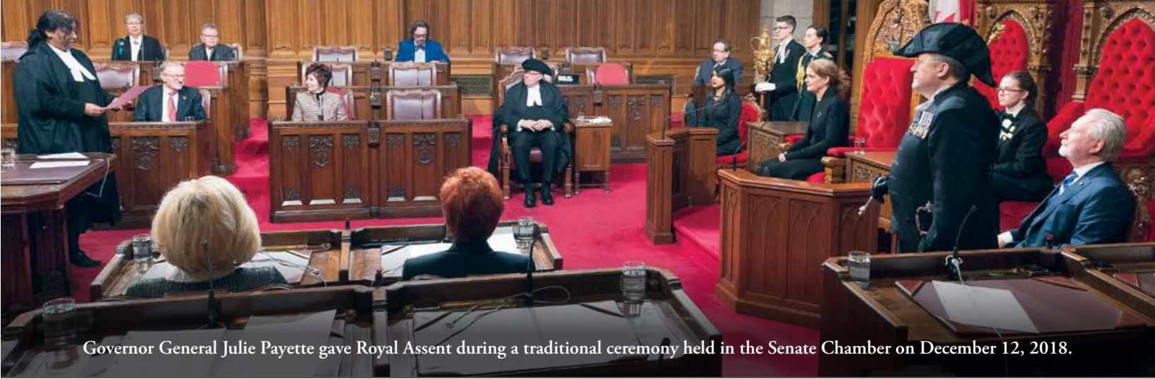
Governor General Julie Payette gave Royal Assent during a traditional ceremony held in the Senate Chamber on December 12, 2018.