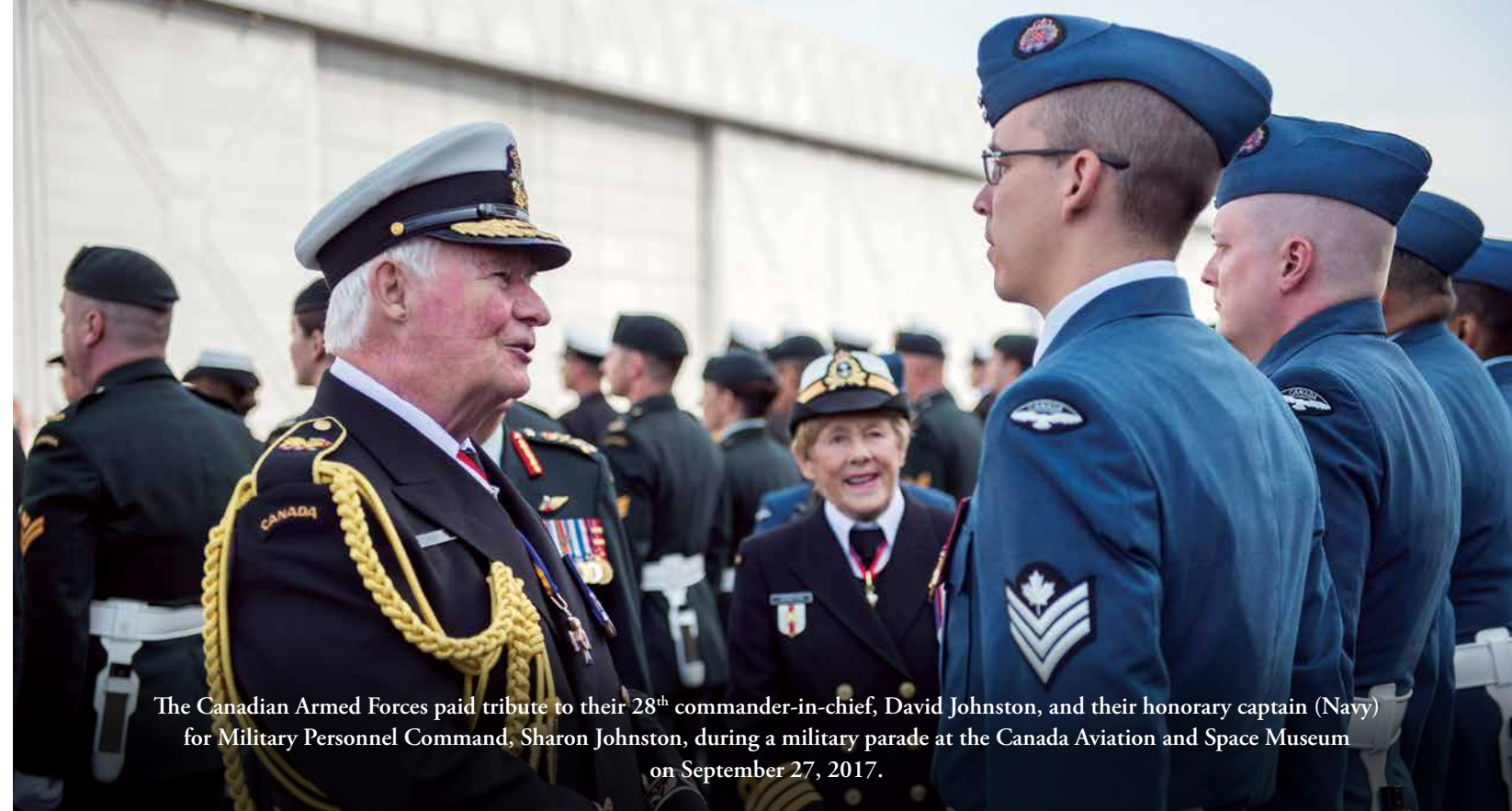
The Canadian Armed Forces paid tribute to their 28 th commander-in-chief, David Johnston, and their honorary captain (Navy) for Military Personnel Command, Sharon Johnston, during a military parade at the Canada Aviation and Space Museum on September 27, 2017.

Throughout the year, governors general David Johnston and Julie Payette recognized exceptional sustained service by members of the Canadian Armed Forces with the insignia of the Order of Military Merit. In addition, Meritorious Service Decorations (Military Division) were presented to individuals whose specific achievements brought honour to the Canadian Armed Forces and to Canada.