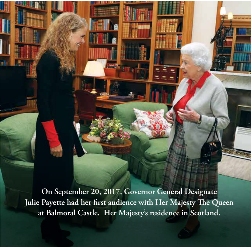
On September 20, 2017, Governor General Designate Julie Payette had her first audience with Her Majesty The Queen at Balmoral Castle, Her Majesty's residence in Scotland.