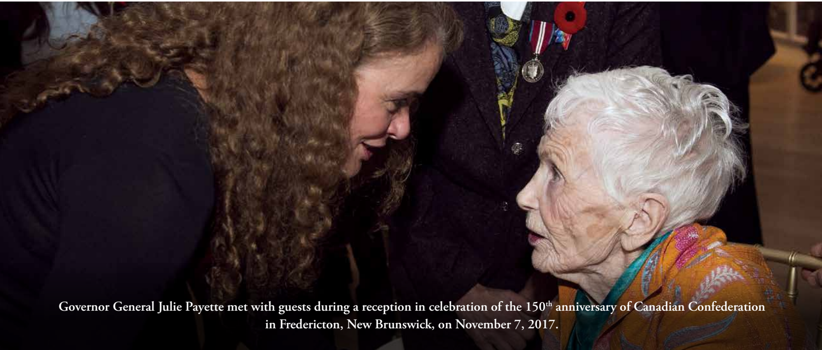
Governor General Julie Payette met with guests during a reception in celebration of the 150 th anniversary of Canadian Confederation in Fredericton, New Brunswick, on November 7, 2017.

Planning and collaboration are key to the success of an official visit by a governor general to a province. Months of preparation and teamwork are required to ensure that the visit, in all its complexity, is executed flawlessly. It was a pleasure to work with the Governor General's team in planning her first official visit to New Brunswick.