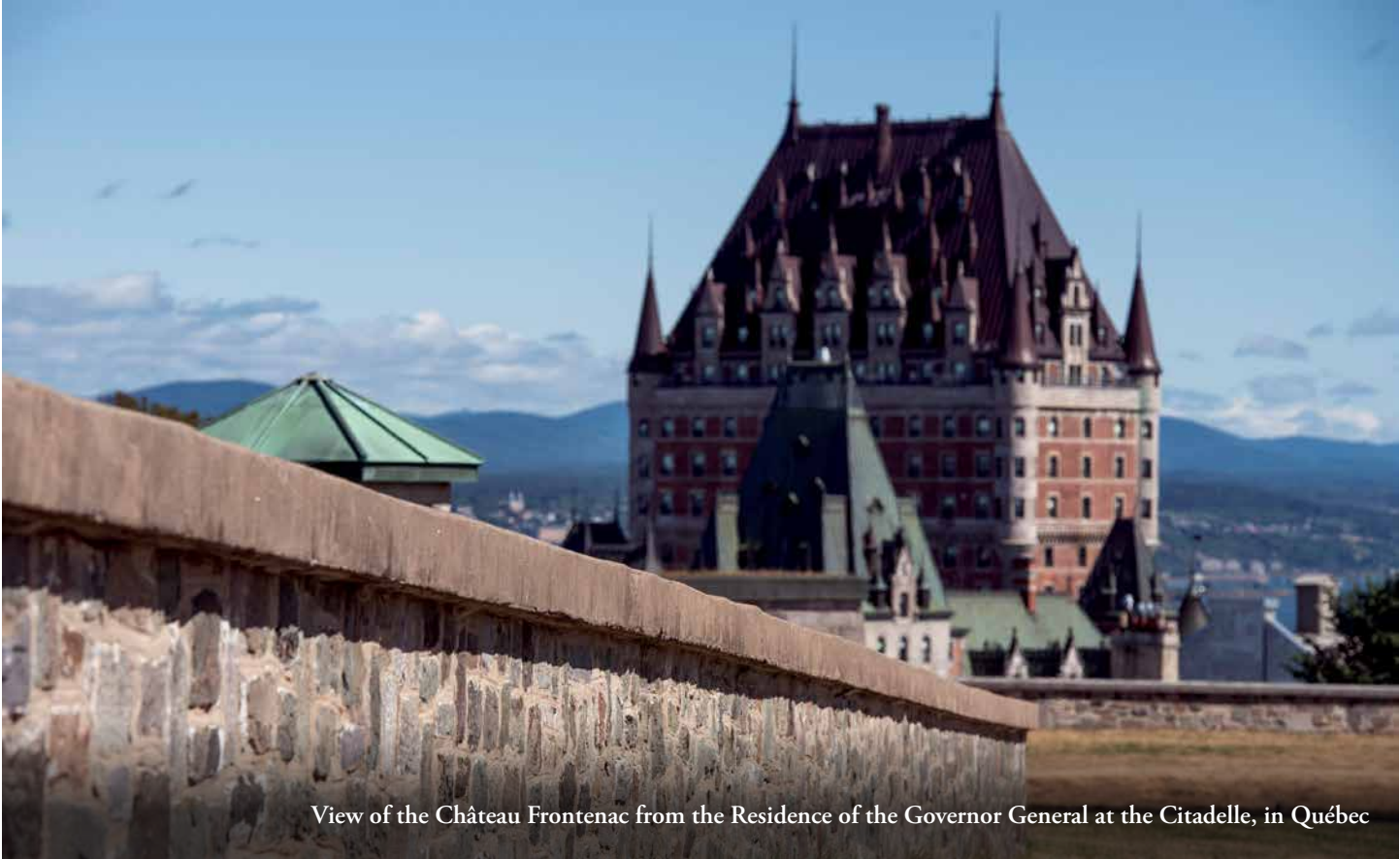
View of the Château Frontenac from the Residence of the Governor General at the Citadel, in Québec