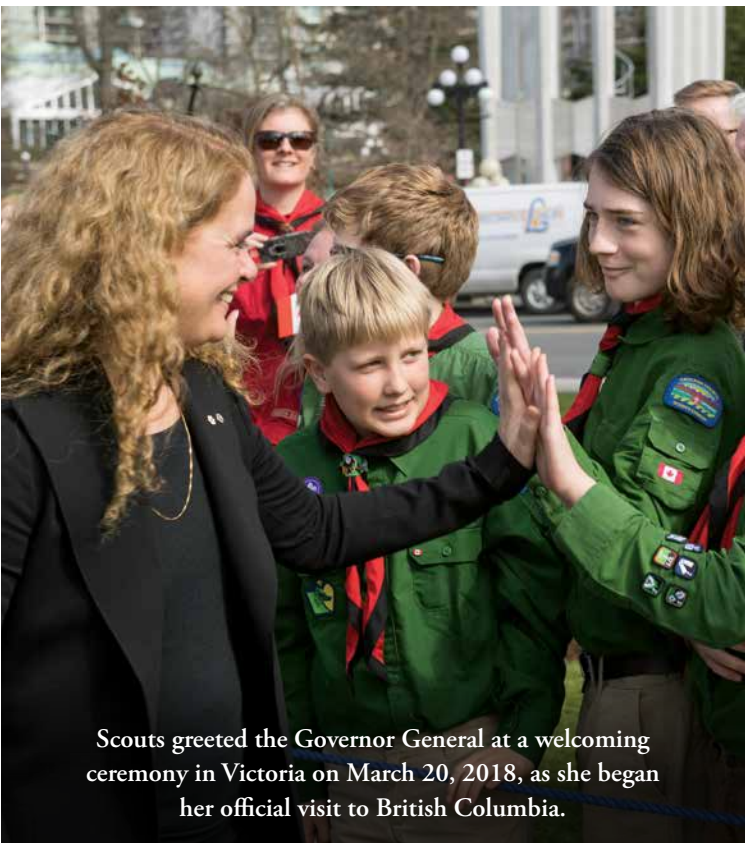
Scouts greeted the Governor General at a welcoming ceremony in Victoria on March 20, 2018, as she began her official visit to British Columbia.