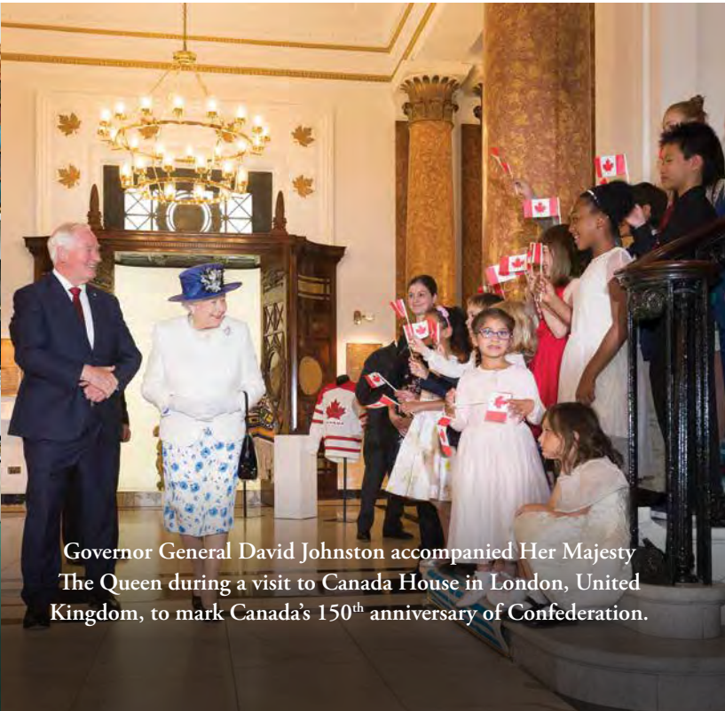
Governor General David Johnston accompanied Her Majesty The Queen during a visit to Canada House in London, United Kingdom, to mark Canada's 150 th anniversary of Confederation.