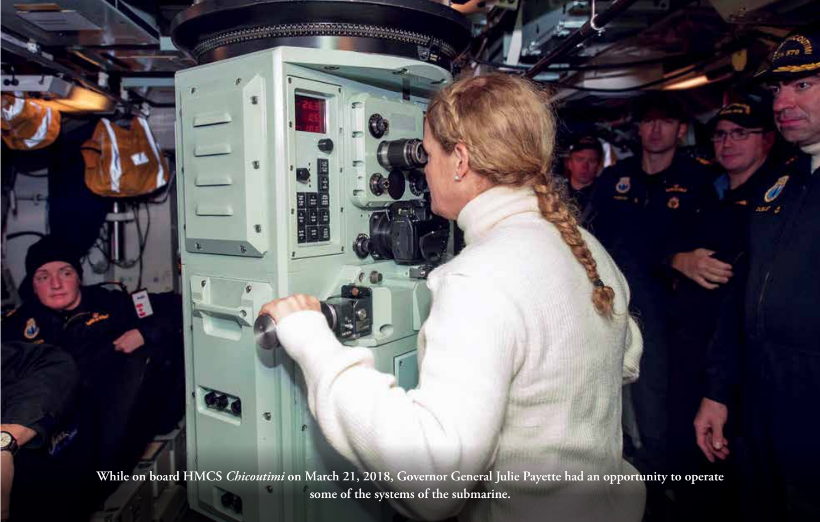
While on board HMCS Chicoutimi on March 21, 2018, Governor General Julie Payette had an opportunity to operate some of the systems of the submarine.

It was an honour to have hosted the Commander-in-Chief onboard Her Majesty's Canadian Submarine Chicoutimi as we returned from our historic Asia-Pacific deployment in 2018. Introducing the crew and demonstrating the systems that allow us to live and operate underwater to someone who has lived in space was a unique pleasure. I hope to welcome the Commander-in-Chief onboard HMCS Victoria in 2019 and have her dive the submarine.