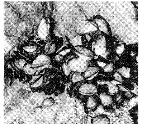
Blue Mussels, Mytilus edulis