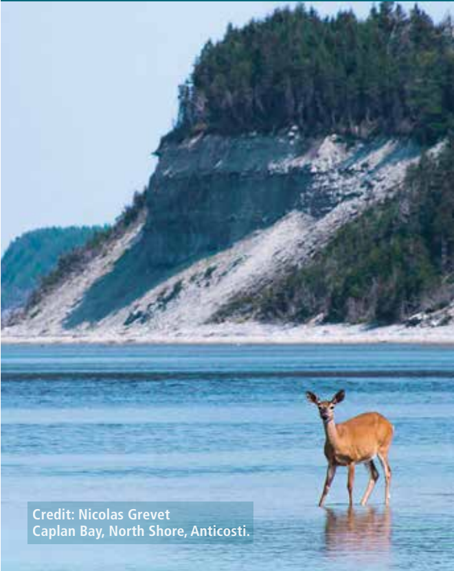
Caplan Bay, North Shore, Anticosti.

More specifically, this means the area between Cornwall and Gaspé on the South shore (including the Québec portion of Chaleur Bay and the Magdalen Islands) and the area between Carillon and Blanc Sablon on the North shore (including Anticosti Island and the Saguenay River). This area also encompasses the main tributaries and sections of secondary tributaries that are essential to the lifecycle of species dependent on the St. Lawrence. Intervention in the secondary tributaries must have a direct connection with the species in question or with nonpoint source agricultural pollution.