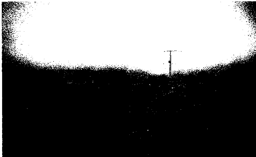
JOINT ARCTIC WEATHER STATION AT ISACHSEN

Canadian staff will replace the U.S. share of the staff at the remaining Joint Weather Stations within two years - Mould Bay and Isachsen in 1971, Resolute and Eureka by 31 October 1972. On a similar schedule Canada will also undertake provision of supplies, parts and equipment formerly provided by the U.S.