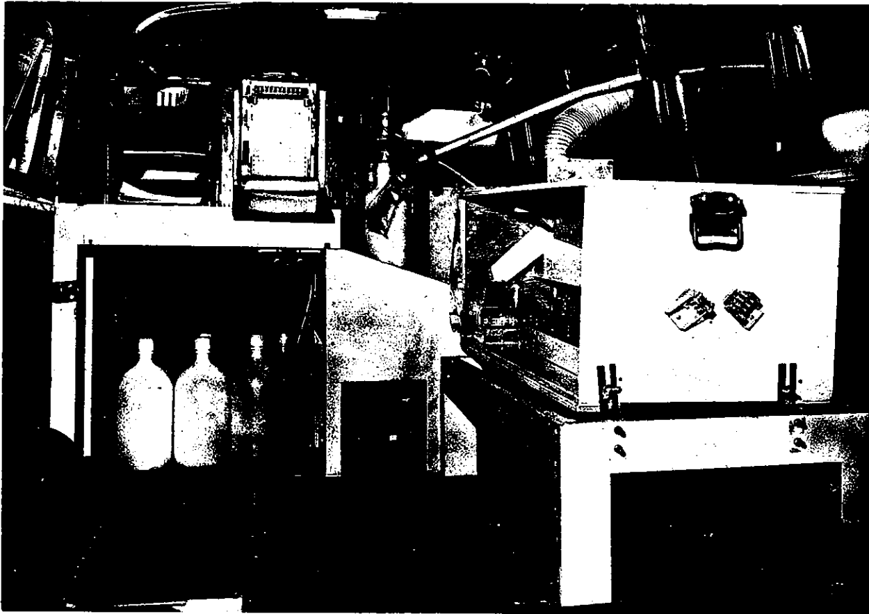
INTERIOR VIEW OF MOBILE PRECIPITATION SAMPLING VEHICLE SHOWING RAIN/HAIL GAUGE AND RECORDER