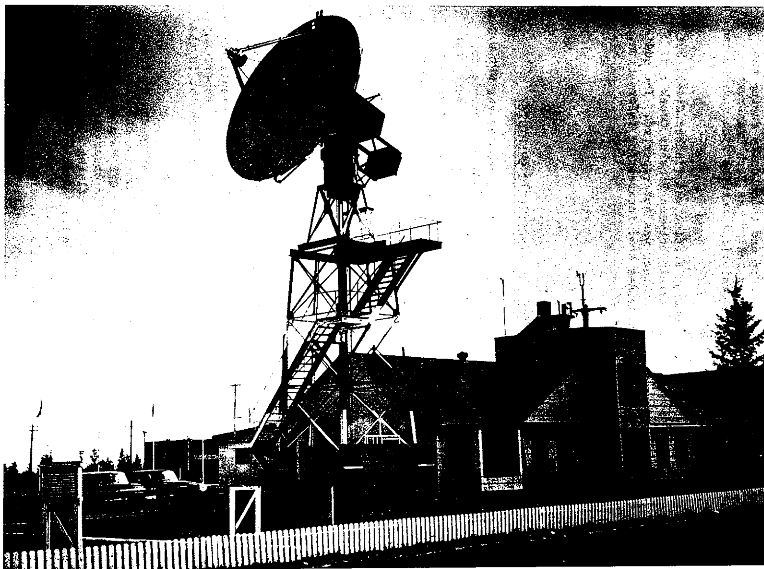
ALBERTA HAIL 10CM WEATHER RADAR AND FIELD PROJECT HEADQUARTERS BUILDING AT C.F.B. PENHOLD