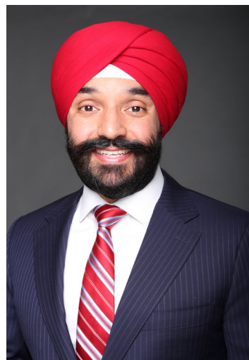
The Honourable Navdeep Bains Minister of Innovation, Science and Economic Development

Together with Canadians of all backgrounds, regions and generations, we are proud to be building a strong culture of innovation to position Canada as a leader in the global economy.